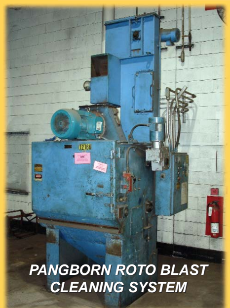
PANGBORN ROTO BLAST CLEANING SYSTEM