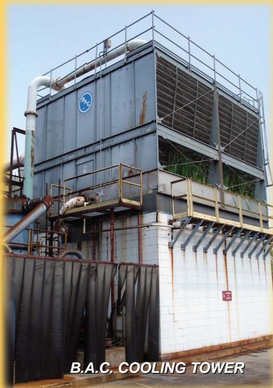
B.A.C. COOLING TOWER