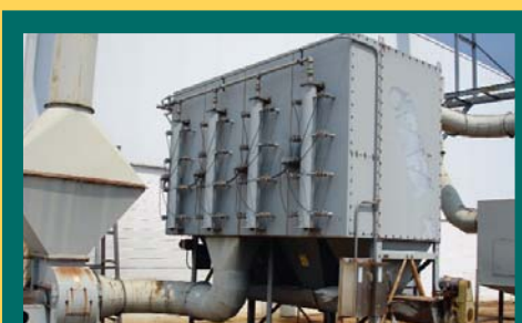
1 OF 2 TORIT DUST COLLECTION SYSTEMS

BRIDGEPORT Vertical Mill, Series I, 2 HP, Power Feed, 9" x 54" Table, S/N 188449 CLAUSING Tool Room Lathe, Model 5911, 59" BTC, 11" Swing, S/N 500437 TITAN 50 Ton Hydraulic H-Frame Press, Model RP50, S/N 4921 CLAUSING Variable Speed Drill Press, Model 1670, 8" x 12" Adjustable Table, 15", 1800 RPM, S/N 15536422 GROB Vertical Band Saw, Model NS16, 16" Thread, Tilt Table, Blade Welder, S/N 8045 WELLS Horizontal Metal Cutting Band Saw, Model BM, Blade 11'6" x ¾" -.035, ½ HP, S/N 15470 TITAN Industrial Horizontal Metal Cutting Band Saw, Model TS100, S/N 10343 WILSON 25 Ton Hydraulic H-Frame Press, Model 37, S/N 4921 Various Oxy/Acet Torch Carts w/ Hoses & Regulators