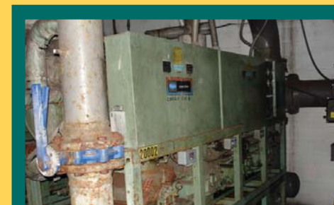
1 OF 2 CARRIER CHILLER UNITS