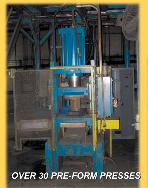
OVER 30 PRE-FORM PRESSES