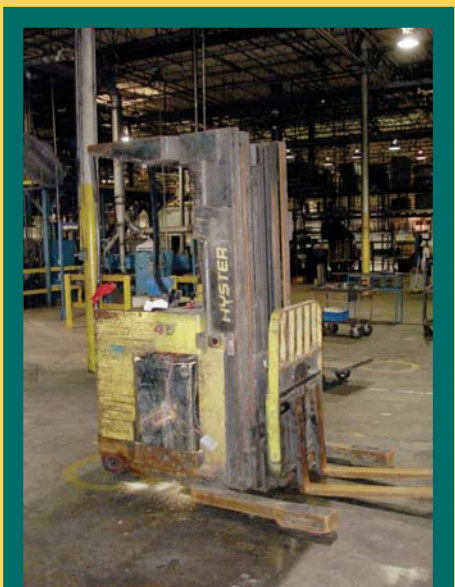
HYSTER ELECTRIC PICKER TRUCK