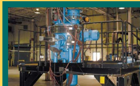
M.T.I. BLENDING SYSTEM