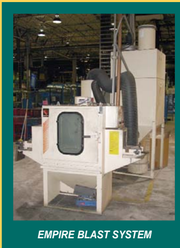
EMPIRE BLAST SYSTEM