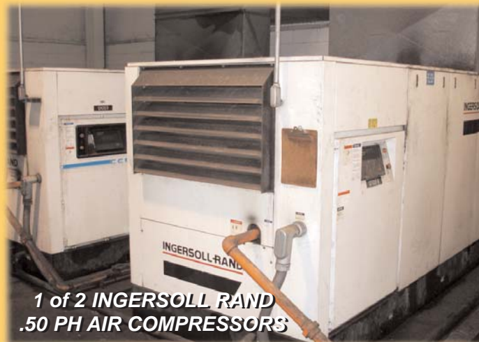
1 of 2 INGERSOLL RAND .50 PH AIR COMPRESSORS