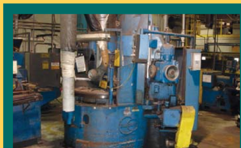
BLANCHARD NO. 16A ROTARY SURFACE GRINDER