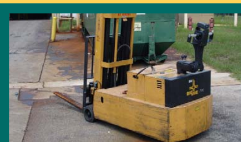
BIG JOE WALK BEHIND PALLET TRUCK