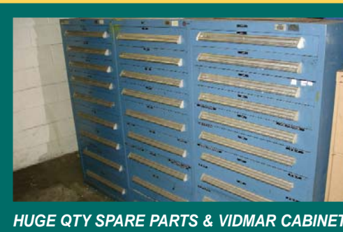
HUGE QTY SPARE PARTS & VIDMAR CABINETS