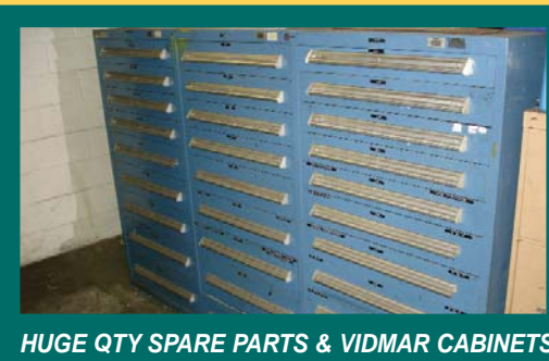
HUGE QTY SPARE PARTS & VIDMAR CABINETS