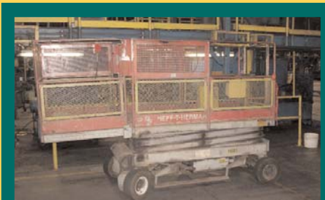
25' ELECTRIC SCISSOR LIFT