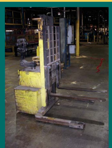
BIG JOE TRI MAST ELECTRIC WALK BEHIND PALLET TRUCK