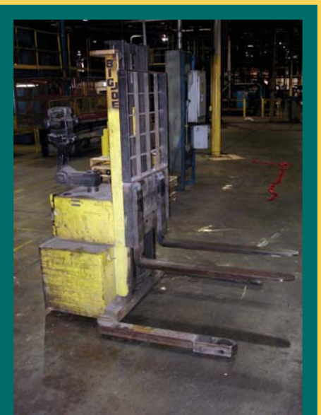
BIG JOE TRI MAST ELECTRIC WALK BEHIND PALLET TRUCK