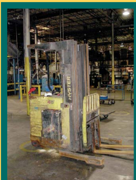
HYSTER ELECTRIC PICKER TRUCK