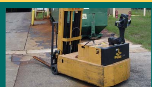
BIG JOE WALK BEHIND PALLET TRUCK