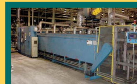
(1) OF (3) 2002 HEATING TECHNOLOGIES IR CURING OVENS