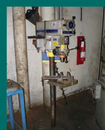
CLAUSING VARIABLE SPEED DRILLPRESS