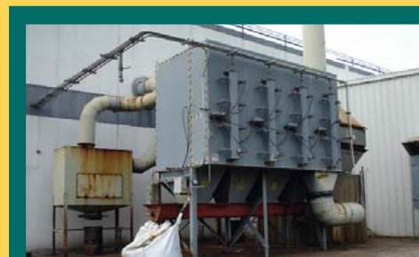
TORIT DUST COLLECTION SYSTEM