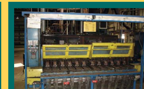
LOW VOLUME GRINDING/CHAMBER MACHINE