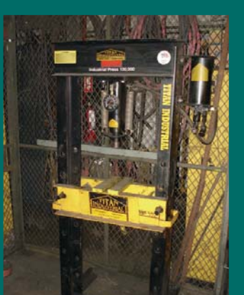
TITAN 50 TON H-FRAME SHOP PRESS