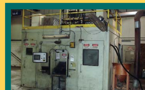
(1) OF (3) ROBOTIC WELDING/BLASTING CELLS