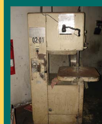
GROB VERTICAL BANDSAW