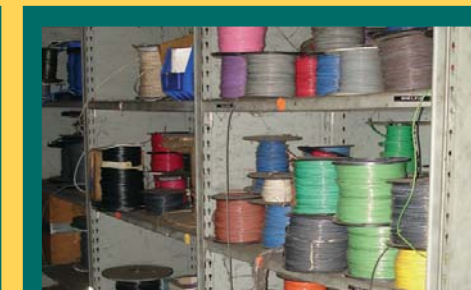
SMALL QTY SPOOLED WIRE