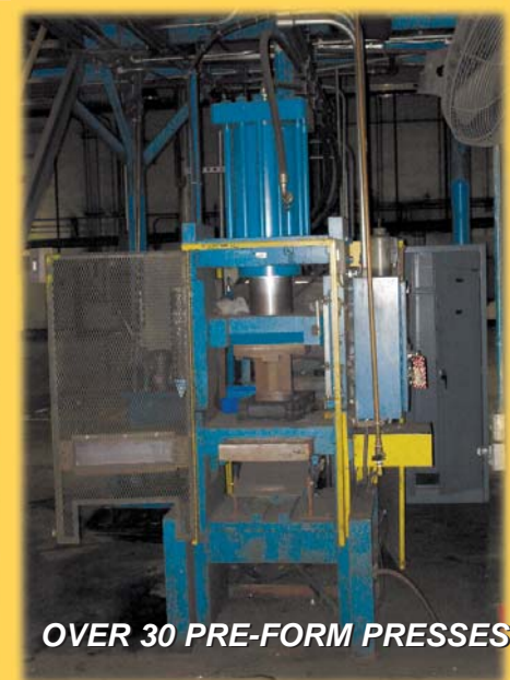
OVER 30 PRE-FORM PRESSES