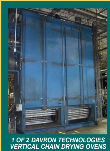
1 OF 2 DAVRON TECHNOLOGIES VERTICAL CHAIN DRYING OVENS