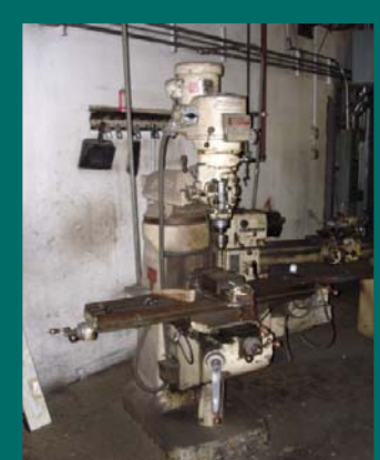
BRIDGEPORT VERTICAL MILLING MACHINE