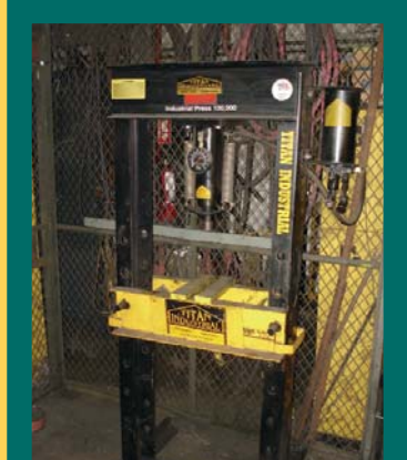
TITAN 50 TON H-FRAME SHOP PRESS