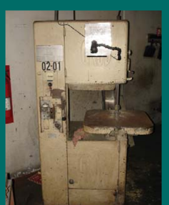
GROB VERTICAL BANDSAW