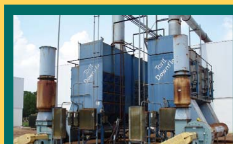
(2) Tafa 32 BAG DUST COLLECTION UNITS