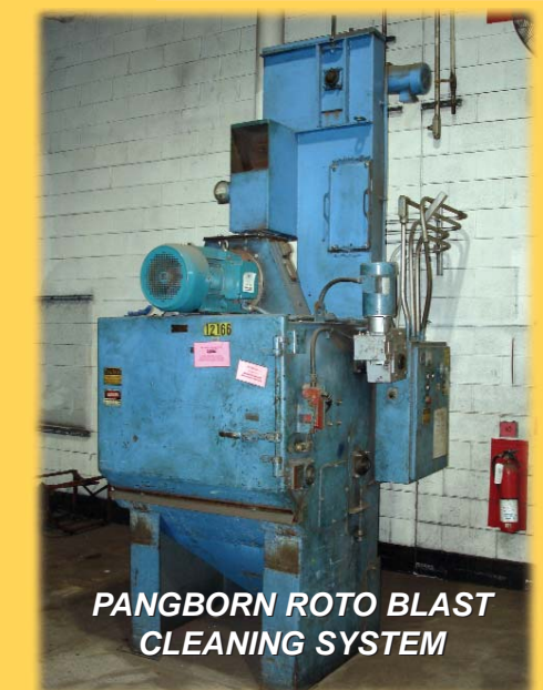
PANGBORN ROTO BLAST CLEANING SYSTEM