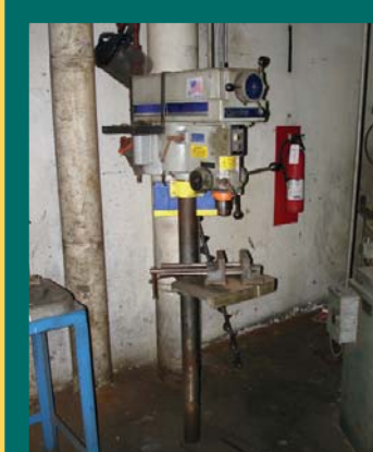
CLAUSING VARIABLE SPEED DRILLPRESS

Hwy 75/231 South Towards Panama City Turn West on Hwy 390 Hwy 390 Turns Into 14th Street *Do Not Follow Tennessee Ave. * Stay To The Right Follow 14th Street to Connecticut Avenue Turn Right & Follow Auction Signs to 1006 Arthur Drive.