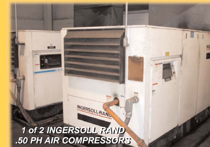
1 of 2 INGERSOLL RAND .50 PH AIR COMPRESSORS

Sale Location: 1006 Arthur Drive, Lynn Haven, FL 32444