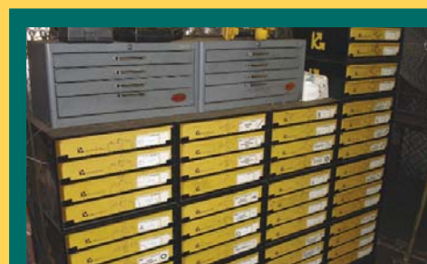
HUGE QTY OF ELECTRICAL COMPONENTS & SURPLUS