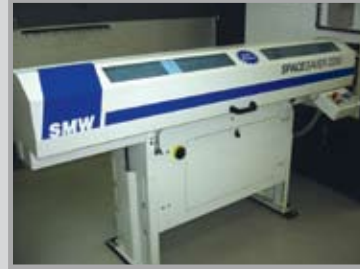
SMW SPACESAVER 2200 BAR FEEDER