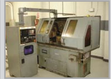
HARDINGE CNC SUPER PRECISION LATHE