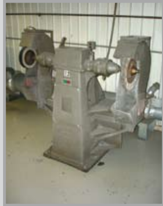
(13) VARIOUS POLISHING LATHES