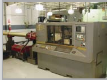
HARDINGE CNC SUPER PRECISION LATHE