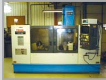
MAZAK VTC-20B CNC VERTICAL MACHINING CENTER