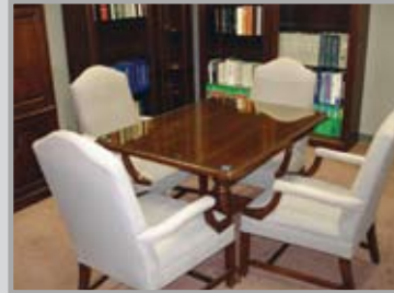
VARIOUS OFFICE FURNITURE