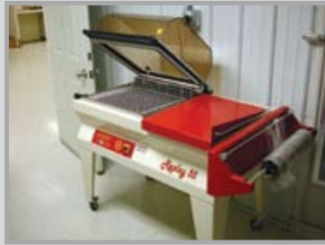
2000 MINI RACK TORRE SKINPACKER