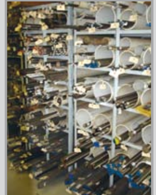
HUGE QTY. OF MEDICAL GRADE & AEROSPACE TOOL STEEL W/ CERTS