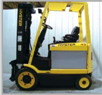
2000 HYSTER 4,500 LB. FORK TRUCK, MODEL E-45-XM, SIDE SHIFT, 3-STAGE, LOW HRS.