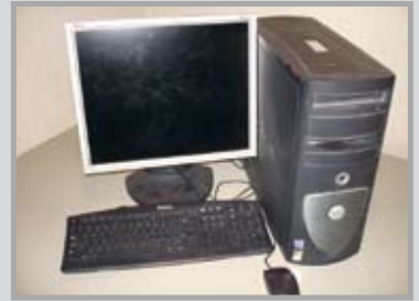
LG. QTY. OF VARIOUS DELL COMPUTERS