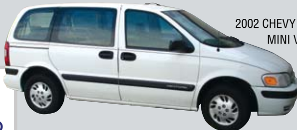
2002 CHEVY VENTURE MINI VAN

1994 FORD EXPLORER, Push Button 4 x 4, 6-Cylinder 4.0 Liter, Air, Cruise, Leather, 116,225 Mileage, Vin. No. 1FMDU34X6RUD94944