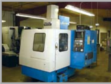
MAZAK VQC-1540 CNC VERTICAL MACHINING CENTER