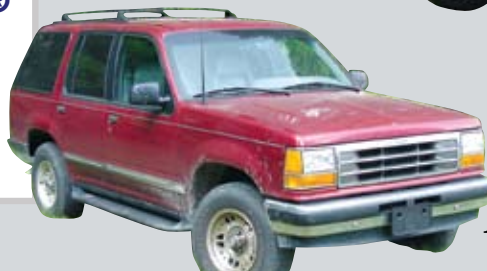
1995 FORD EXPLORER