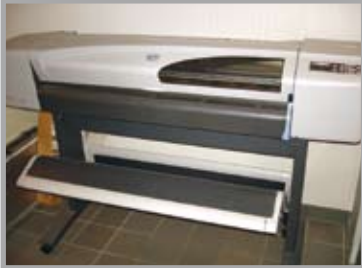
HP DESIGN JET 6000 ENGINEERING COPIER