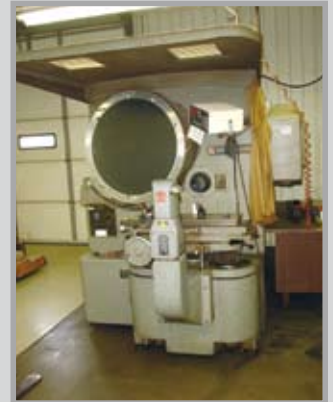
J & L OPTICAL COMPARATOR

NCS Computer, AMD Athlon Processor, 1.2 GHZ Processor Speed, 224 MB Ram, 17" DELL Flat Panel Monitor