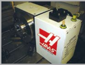
VARIOUS HAAS INDEXERS