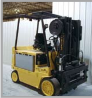
2000 HYSTER 5,000 LB. FORK TRUCK, MODEL E-50-XM, SIDE SHIFT, 3-STAGE, LOW HRS.