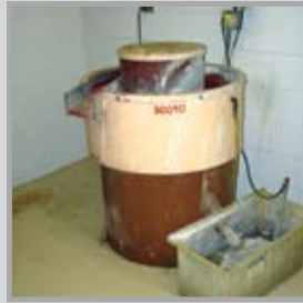
ROSEMONT VIBRATORY POLISHER