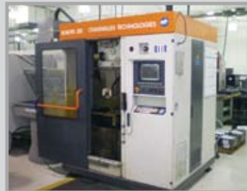
1994 CHARMILLES 310 ROBOFIL WIRE EDM