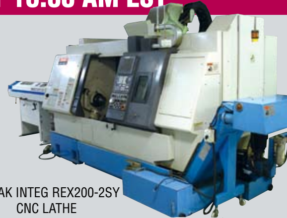
MAZAK INTEG REX200-2SY CNC LATHE