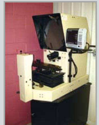
SCHERR TUMICO INDUSTRIES 20" OPTICAL COMPARATOR