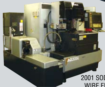
2001 SODICK WIRE EDM