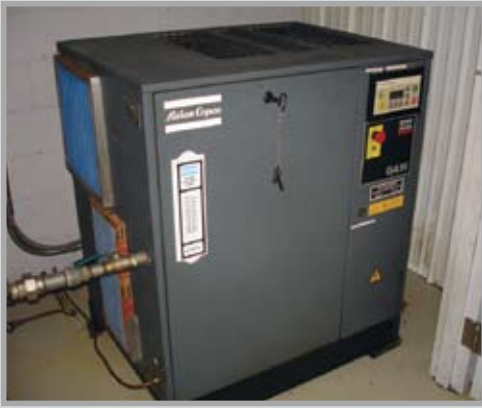
ATLAS COPCO 25 HP ROTARY SCREW AIR COMPRESSOR W/ DRYER