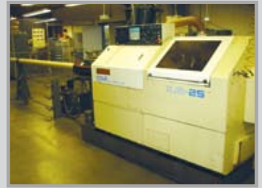
(2) STAR KJR-25 AUTOMATIC LATHES