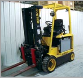
2000 HYSTER 8,000 LB. FORK TRUCK, MODEL E-80-XL, SIDE SHIFT, 3-STAGE, LOW HRS.