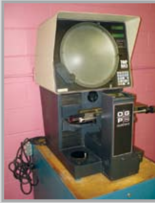
1996 OGP INC. 20" OPTICAL COMPARATOR