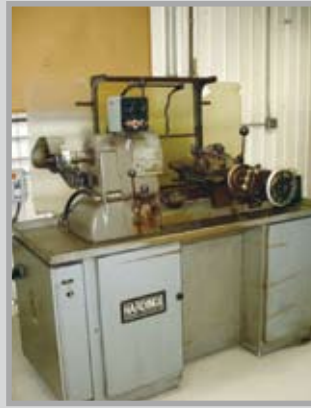
HARDINGE SECOND OPERATION LATHE