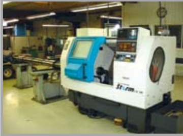
CLAUSING COLCHESTER 'STORM' CNC LATHE