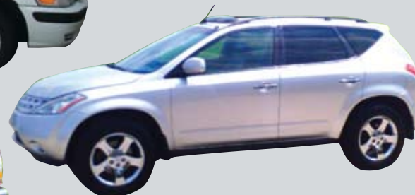
2003 NISSAN MURANO