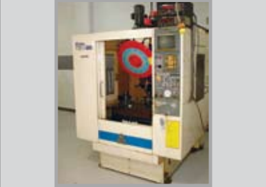
MIYANO TSV-35 CNC VERTICAL MACHINING CENTER