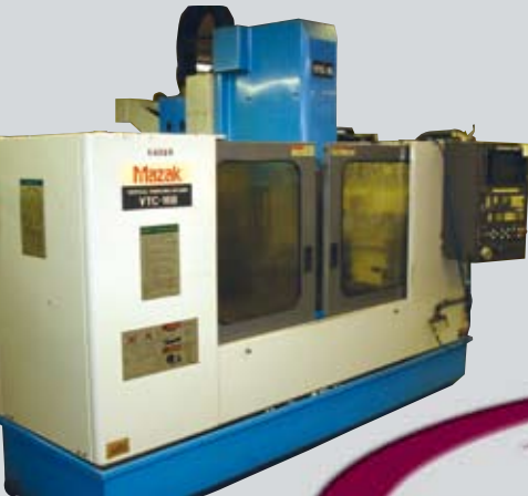
MAZAK VTC-16B VERTICAL MACHINING CENTER