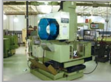
OKUMA MC-3VA CNC VERTICAL MACHINING CENTER