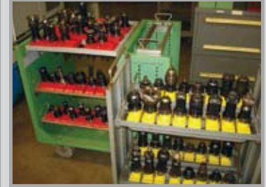
(OVER 100) CNC CAT 40 TOOL HOLDERS