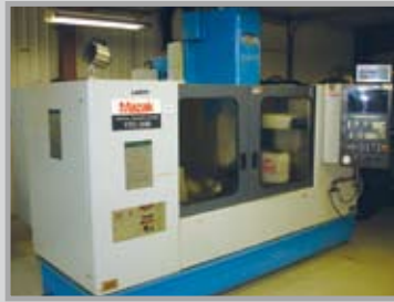
MAZAK VTC 20B CNC VERTICAL MACHINING CENTER