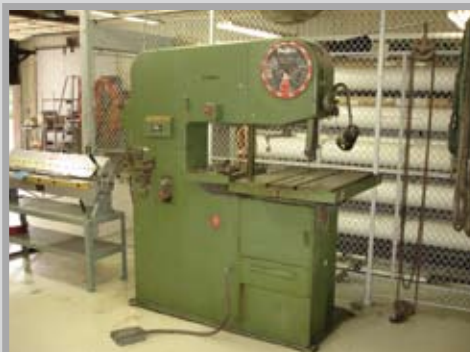
DO ALL 36" VERTICAL BAND SAW