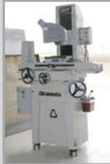
OKAMOTO SURFACE GRINDER