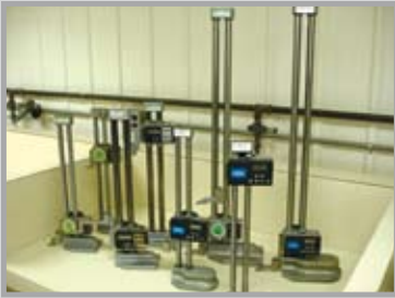
HUGE QTY. OF INSPECTION EQUIPMENT