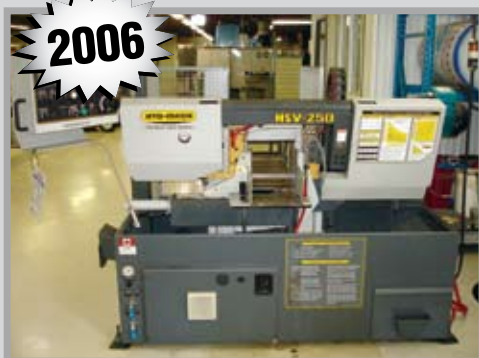
HYD-MECH CNC BAND SAW