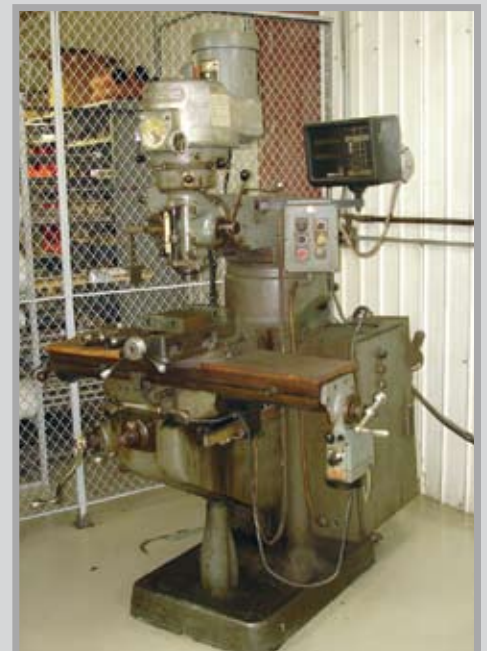
BRIDGEPORT VERTICAL MILLING MACHINE

Join Our Mail List to Receive Early Notification of Upcoming Auctions and Liquidations!