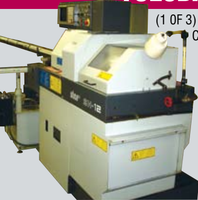
(1 OF 3) STAR AUTOMATIC CNC LATHES

TUESDAY, JUNE 19th • BEGINNING AT 10:00 AM EST