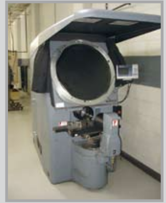
J & L 30" OPTICAL COMPARATOR