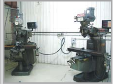
(2 OF 3) VARIOUS VERTICAL MILLING MACHINES