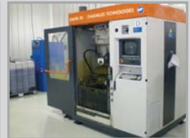
1995 CHARMILLES 300 ROBOFIL WIRE EDM