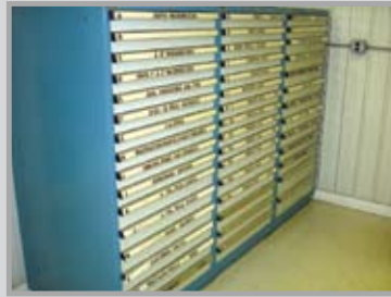
LG. QTY. LISTA CABINETS