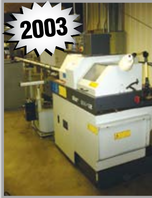
2003 STAR SH-12 CNC LATHE