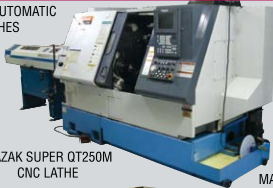
MAZAK SUPER QT250M CNC LATHE