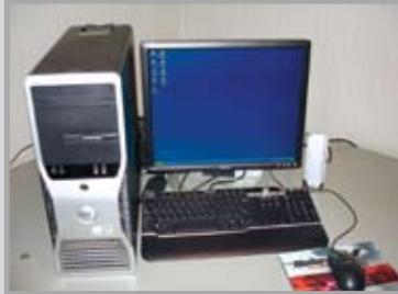
LG. QTY. OF VARIOUS DELL COMPUTERS W/ FLAT PANELS