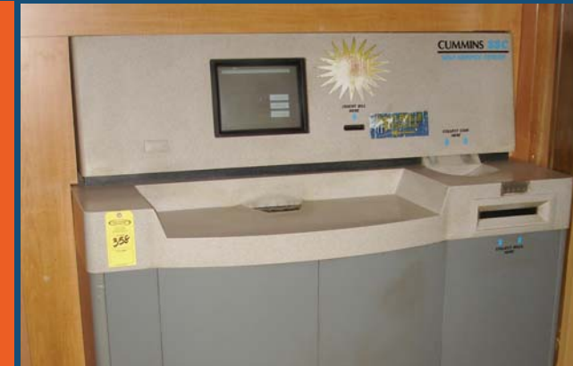
(1 OF 3) CUMMINS SELF SERVICE COIN & BILL STATIONS