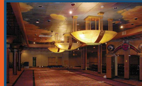
HUGE QTY OF DECORATIVE LIGHTING & FIXTURES