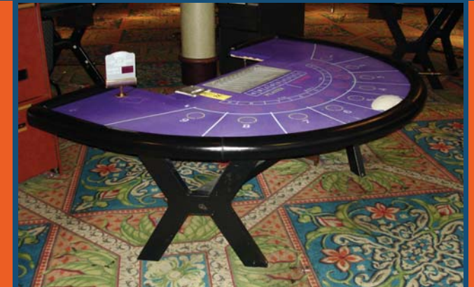
(30+) BLACKJACK & POKER GAMING TABLES