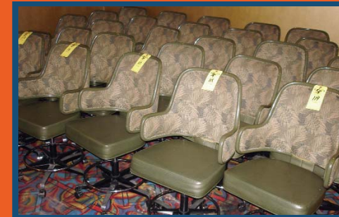
(1500+) HIGH BACK SWIVEL CHAIRS & STOOLS