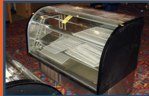
(1 OF 3) DELFIELD REFRIGERATED DISPLAY CASES