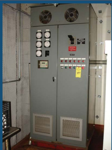
LG. QTY. OF TRANSFORMERS &

Far too much to list...items being added daily! View www.charlestonauctions.com for complete listings!