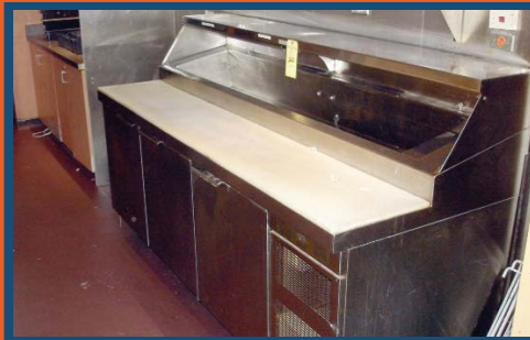
(1 OF 3) PERLICK REFRIGERATED SANDWICH PREP TABLES