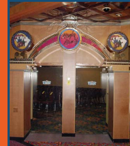
HUGE QTY OF VARIOUS NEON & MESSAGE BOARDS