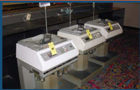
(1 OF 15) CUMMINS JETSORTERS