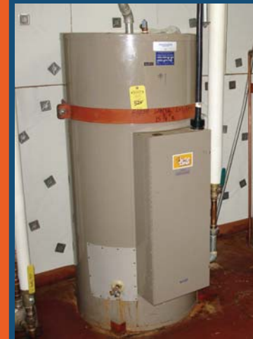
(1 OF 2) A.O. SMITH LG. CAPACITY WATER HEATERS