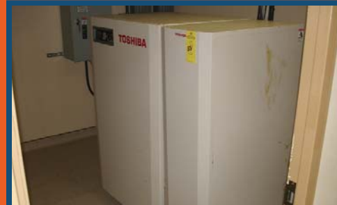
TOSHIBA UNINTERRUPTIBLE POWER SUPPLY