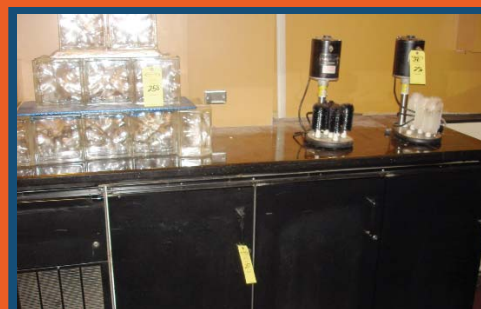
(1 OF 5) PERLICK REFRIGERATED KEG COOLERS W/TAPPERS