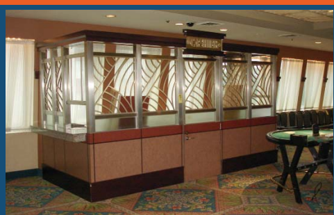
(1 OF 4) COMPLETE CASHIER CAGES