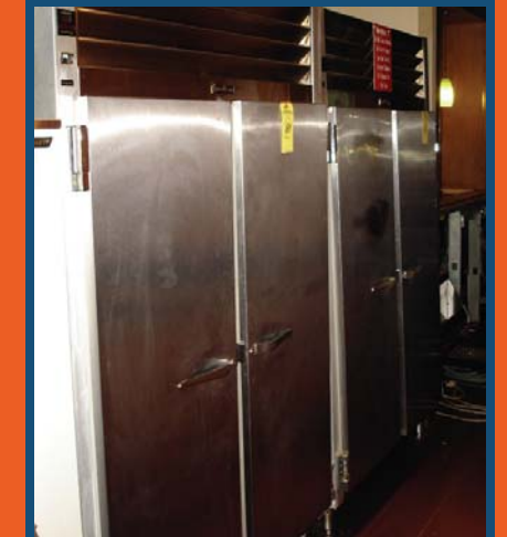
(2 OF 6) TRAUlsen DBL. DOOR STAINLESS STEEL REFRIGERATORS &/OR FREEZERS

Preview Inspection: Monday, October 2nd • 9:00 A.M. - 5:00 P.M.