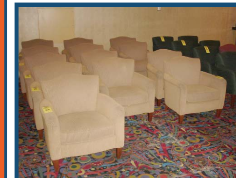
(100+) COMPLETE HOTEL ROOMS

(4) 2003 LENNOX "L" Series Air Conditioners, Model LCC102SNIG, 3-Phase, S/N's 5602E07530, 5602E07527, 5602E07529 & 5602E07528 Lg. Qty. Of Electrical Boxes & Components To Include: • SIEMENS Transformer, Model SIM0REG, S/N SAG4996-13 • OLSUN Transformer; KVA = 1040 Auto; Hertz = 60; Amps = 1251; S/N 23467 S-80683-2 • (2) A.O. SMITH Electric Water Heaters, Model DSE120-90, Working Pressure = 150, S/N SE97-67170 • Huge Qty. Of "New In The Box" Light Bulbs & Ballasts Huge Qty. Of Ceiling Fans, Hanging Lights, Carpet, Room Dividers, Brass, Handrails, Floor Mats Lg. Qty. Of Copper Wire On Spools Various Wood Columns Lg. Qty. Of Various Filters