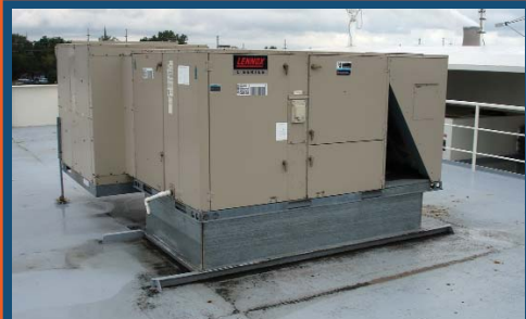
(1 OF 4) LENNOX "L" SERIES ROOFTOP AIR CONDITIONING UNITS