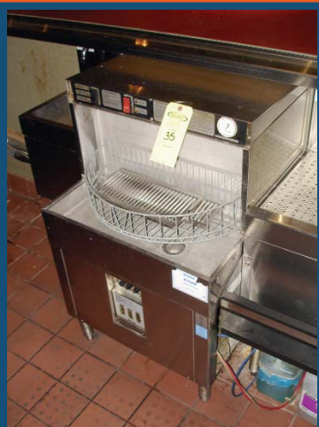
BAR TYPE AUTOMATIC GLASS WASHER