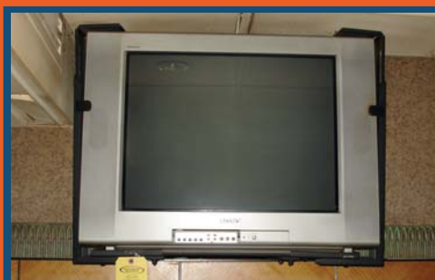
(10+) VARIOUS TELEVISIONS