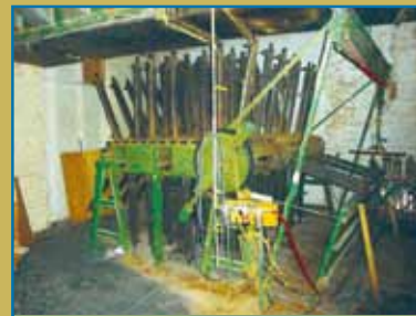
TAYLOR GLUE CLAMP