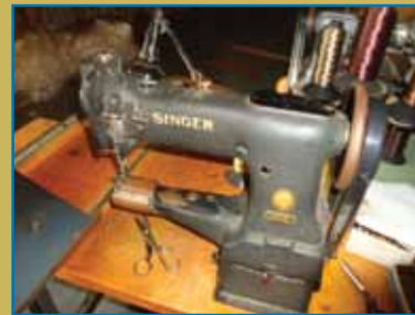
SMARTSIDE EXTERIOR TRIM