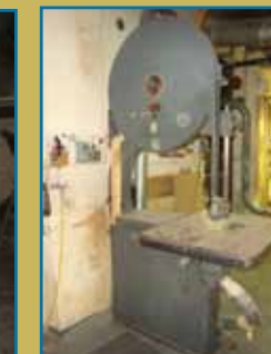
(1 OF 4) TANNEWITZ 36" VERTICAL BAND SAWS