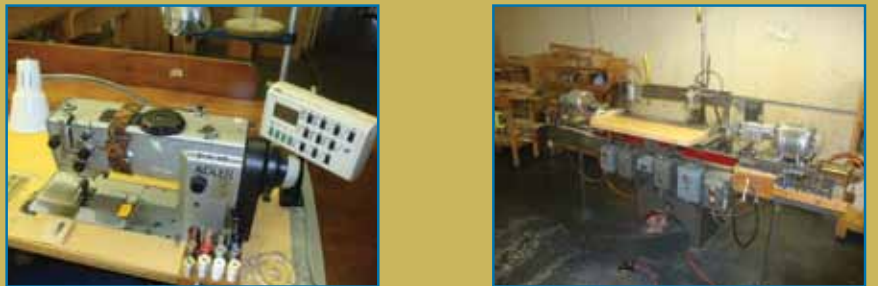
ADLER SEWING MACHINE WITH DIGITAL CONTROLS INDIANA DRILLING & BORING MACHINE