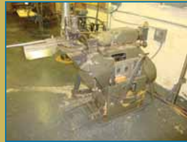
RICHARDSON DRILLING & CUTOFF MACHINE