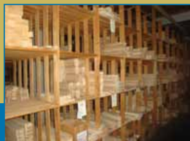
HUGE QTY. OF READY TO FINISH INVENTORY