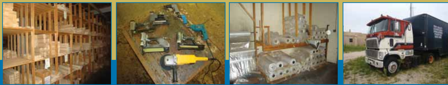
HUGE QTY. OF READY TO FINISH INVENTORY HUGE QTY. OF VARIOUS AIR, HAND & ELECTRIC TOOLS POLY BAGS 1984 FORD SEMI TRACTOR