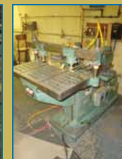
NEWTON DRILLING MACHINE