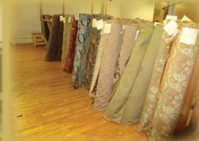
THOUSANDS OF YARDS OF FABRIC