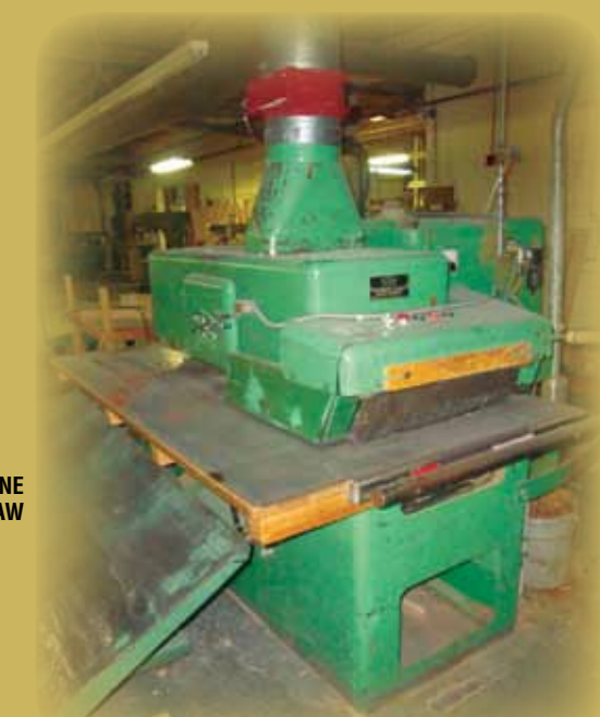
STETSON INLINE RIPSAW

PROPRIETARY INVENTORY & PATTERNS AVAILABLE AS A BULK PACKAGE PRIOR TO THE AUCTION