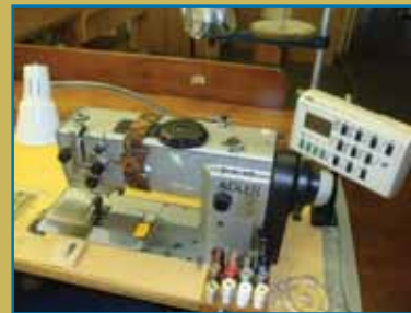
ADLER SEWING MACHINE WITH DIGITAL CONTROLS