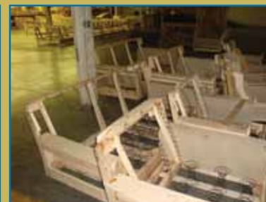
CHAIR & SOFA IN PROCESS INVENTORY