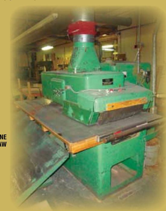
STETSON INLINE RIPSAW

PROPRIETARY INVENTORY & PATTERNS AVAILABLE AS A BULK PACKAGE PRIOR TO THE AUCTION