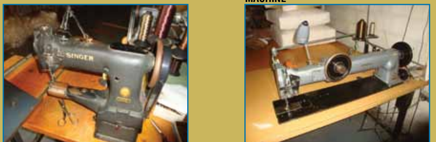
SMARTSIDE EXTERIOR TRIM SINGER DEEP CAPACITY SEWING MACHINE