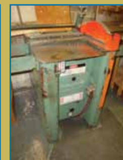
INDUSTRIAL UP CUT SAW