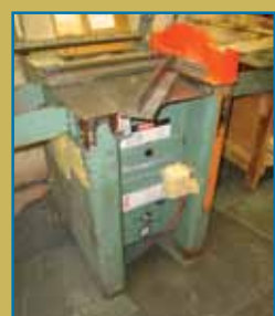
(1 OF 3) UP CUT SAWS