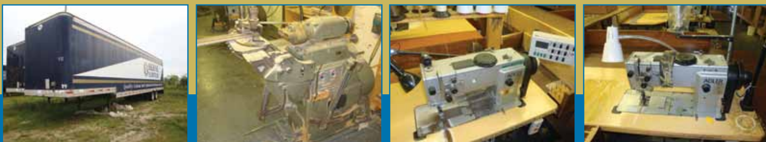
1992 GREAT DANE TRAILER (1 OF 2) RICHARDSON DRILLING & CUTOFF MACHINES (1 OF 5) ADLER SEWING MACHINES WITH DIGITAL CONTROLS (1 OF 20) ADLER SEWING MACHINES

OVER (100) SINGER, UNITED, JONOME, JUKI, ADLER Sewing Machines, Surger, DBL & Triple Surgers, FAR TOO MANY TO LIST. DON'T MISS THIS CHANCE TO UPDATE YOUR ASSEMBLY PROCESS