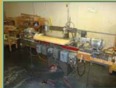
INDIANA DRILLING & BORING MACHINE