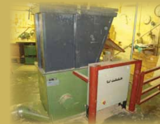
1992 ZENO WOOD CHIPPER