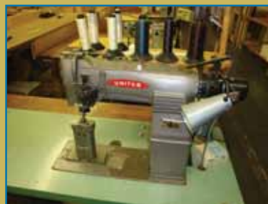
UNITED SEWING MACHINE