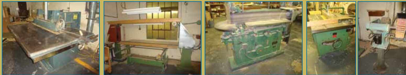
20 HP INLINE RIPS AW BEACH 8" BELT SANDER OAKLEY 8" BELT SANDER LH SIDE: (1 OF 2) TANNEWITZ TABLE SAWS RH SIDE: (1 OF 20) VARIOUS SANDING MACHINES