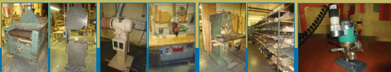
LH SIDE: BUSS PLANNER LH SIDE: EKSTROM CALSON DRUM SANDER LH SIDE: PORTER PIN ROUTER WOLF CLIPPER FABRIC SHEAR RH SIDE: CRESENT VERTICAL BANDSAW RH SIDE: NORTHFIELD UNI-POINT SAW RH SIDE: IN PROCESS INVENTORY

THINKING OF HAVING AN AUCTION? Call a Charleston Representative Today to Schedule a Confidential Meeting. (260) 373-0850 or (877) 357-8124