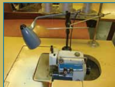
SINGER SEWING MACHINE