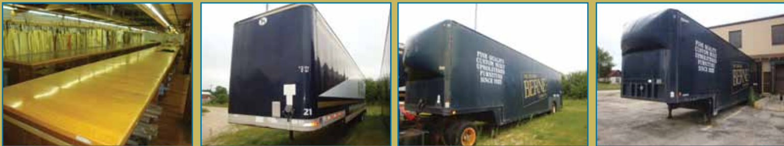
(1 OF 20) 30" LONG LAYOUT TABLES DROP DECK GREAT DANE TRAILER 1977 DORSEY TRAILER 1981 KENTUCKY TRAILER