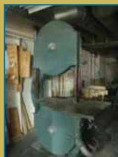
(1 OF 5) 36" VERTICAL BAND SAWS

1335 US 27 N. Berne, IN 46711 Phone: 260-589-8955 Fax: 260-589-8698