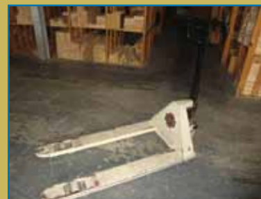
(1 OF 5) JET PALLET JACKS