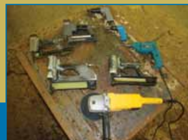
HUGE QTY. OF VARIOUS AIR, HAND & ELECTRIC TOOLS