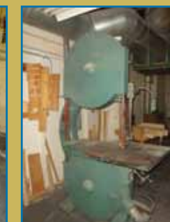
TANNEWITZ 36" VERTICAL BAND SAW