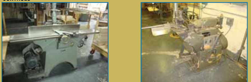
NORTHFIELD JOINER RICHARDSON DRILLING & CUTOFF MACHINE