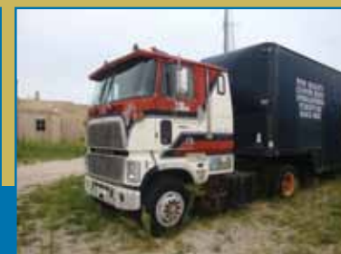
1984 FORD SEMI TRACTOR