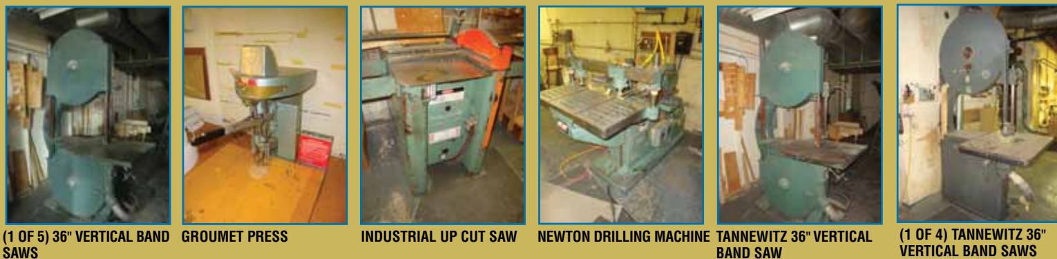
(1 OF 5) 36" VERTICAL BAND SAWS GROUMET PRESS INDUSTRIAL UP CUT SAW NEWTON DRILLING MACHINE TANNEWITZ 36" VERTICAL BAND SAW (1 OF 4) TANNEWITZ 36" VERTICAL BAND SAWS

DRIVING DIRECTIONS FROM THE FORT WAYNE INTERNATIONAL AIRPORT 1. Start out going EAST on W. FERGUSON RD. toward 6TH ST. (5.0 mi.) 2. Turn RIGHT onto US-27 S/DECATUR RD. Continue to follow US-27 S. (26.6 mi.) 3. Turn LEFT onto W. COMPROMISE ST. (0.3 mi.) 4. Turn RIGHT onto N. BEHRING ST. (0.1 mi.) 5. Turn LEFT onto E. BERNE ST. (0.1 mi.) 6. 150 BERNE ST. is on the RIGHT Destination will be on the left-Follow Auction Signs! COMFORT INN 11.1 Miles from Auction Site 260-724-8888 DAYS INN 12.9 Miles from Auction Site 260-728-2196 HOLIDAY INN EXPRESS 13.7 Miles from Auction Site 260-824-4455 BLACK BEAR INN & SUITES 1335 US 27 N. Berne, IN 46711 Phone: 260-589-8955 Fax: 260-589-8698