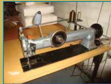
SINGER DEEP CAPACITY SEWING MACHINE