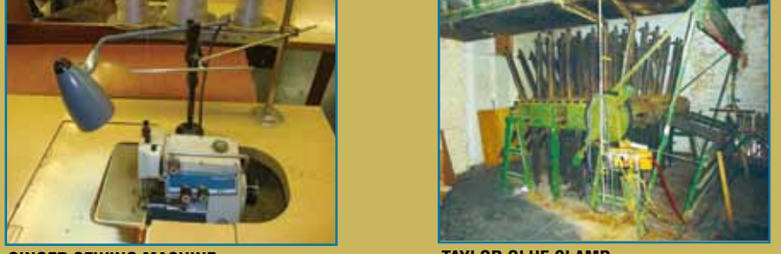
SINGER SEWING MACHINE TAYLOR GLUE CLAMP