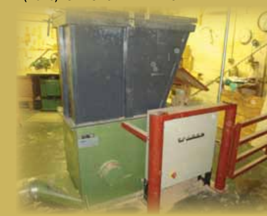
1992 ZENO WOOD CHIPPER