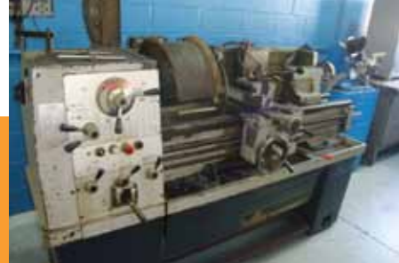
WILLIS MICRO CUT GAP BED LATHE