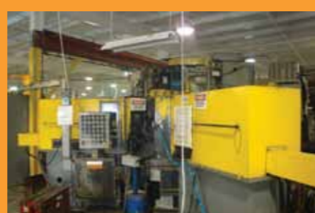
KINGSBURY 4 SPINDLE DRILLING MACHINE