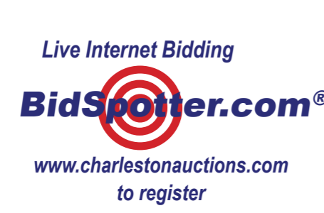
www.charlestonauctions.com to register