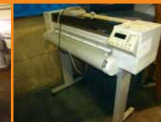
HP DESIGN JET 650 PLOTTER