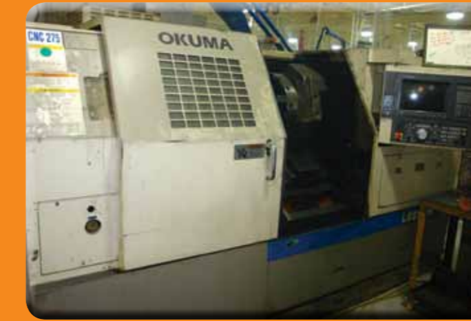
OKUMA LB25 M CNC LATHE