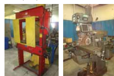
LH PIC: DAKE 50 TON H FRAME SHOP PRESS RH PIC: LAGUN FTV 2 VERTICAL KNEE MILL