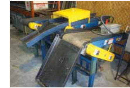
HUGE QTY. OF VARIOUS CONVEYOER