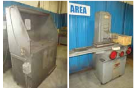
LH PIC: (1 OF 3) 2 X 4 DOWN DRAFT TABLES RH PIC: ABRASIVE 618 HANDFEED SURFACE GRINDER