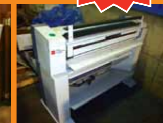
XEROX EXS 2001 ENGINEERING SYSTEM