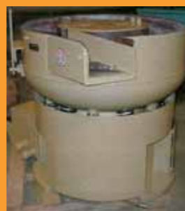
(1 OF 4) ROTO FINISH VIBRATORY SYSTEMS