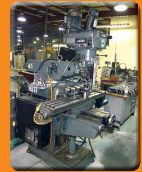
LA GUN MILL