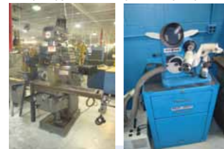
LH PIC: LAGUN FTV 2 VERTICAL MILLING MACHINE RH PIC: MEGA POINT PRECISION GRINDER