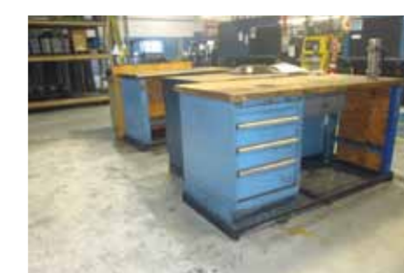
(OVER 10) VARIOUS WORK BENCHES