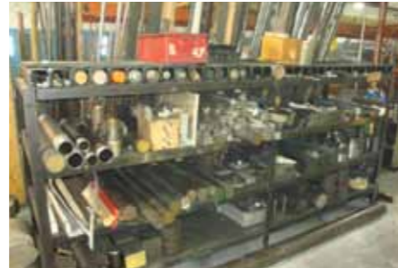
VARIOUS TOOL STEEL