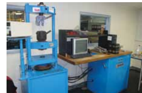
WARNER & SWASEY 60 HV TENSILE TESTER