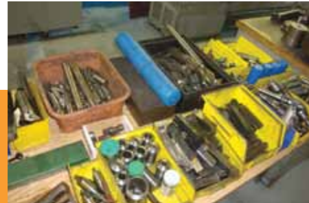
LARGE QTY. OF LATHE TOOLING