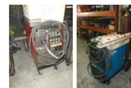
LEFT PIC: LINCOLN IDEAL ARC SP 225 WIRE WELDER RIGHT PIC: MILLER MILLERMATIC 300 WIRE WELDER