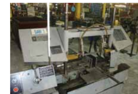
WELLS HORIZONTAL BAND SAW