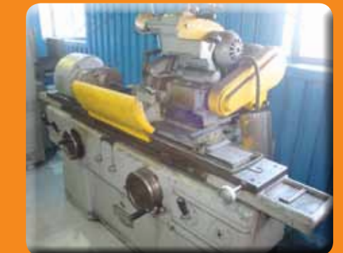
GIUSTINA OD GRINDER