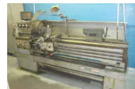
LEADER 1560 TOOL ROOM LATHE