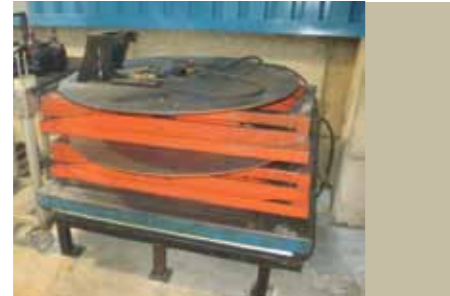
LH PIC: VARIOUS HYDRAULIC LIFT TABLES