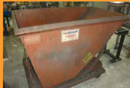
(1 OF 6) DUMP HOPPERS