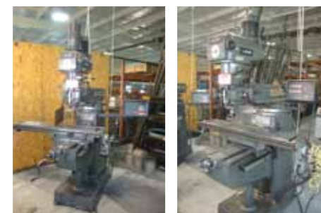
LH PIC: LAGUN FTV 2 VERTICAL MILLING MACHINE WITH DRAW BAR & POWER FEED RH PIC: LAGUN FTV 2 VERTICAL MILLING MACHINE