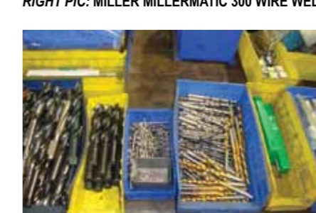
LARGE QTY. OF PERISHABLE TOOLING