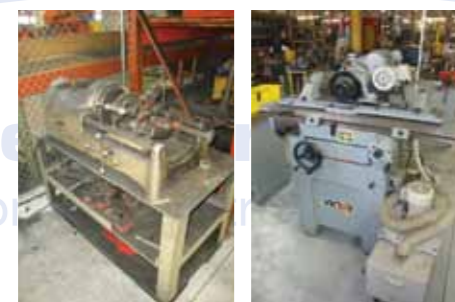
LH PIC: RIDGID 535 POWER THREADER RH PIC: VICTOR TM 40 UNIVERSAL GRINDER