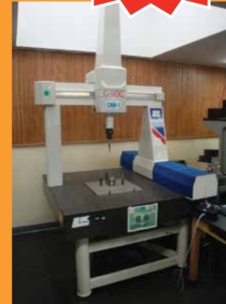
1997 LK G90C CMM

Visit our web site: www.charlestonauctions.com for upcoming auctions and to visit our marketplace.