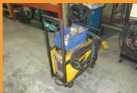
ESAB PCM 875 PLASMA CUTTER