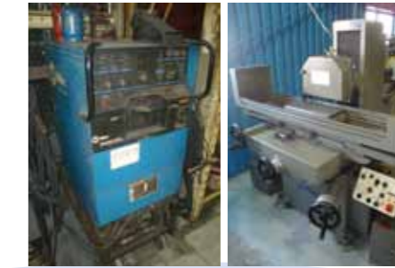
LEFT PIC: MILLER SYNCROWAVE 350 XL WELDING POWER SOURCE RIGHT PIC: SHARP SH 920 3 HP GRINDER