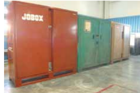
VARIOUS JOB BOXES