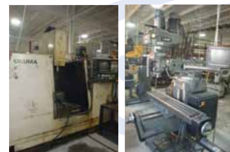
LH PIC: (1) OKUMA CNC CADET V VERTICAL MILLING MACHINES RH PIC: (1 OF 4) LAGUN VERTICAL MILLING MACHINES