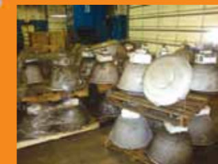
(70) HIGH BAY LIGHT FIXTURES

Preview Inspection: Thursday, March 25th, from 9:00 am to 5:00 pm EST (Local Time)