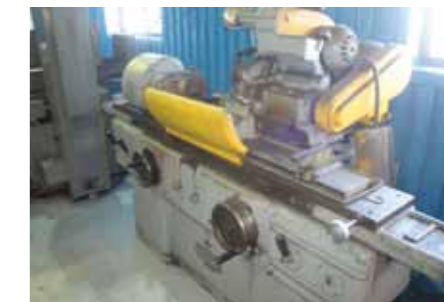
GIUSTINA OD GRINDER