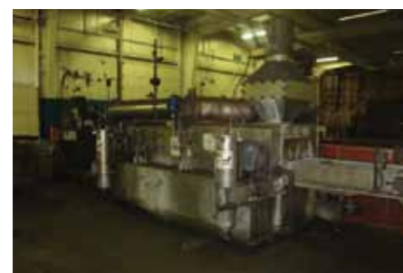
2002 MIDBROOK PARTS WASHER