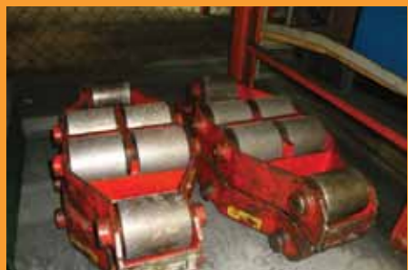
HEAVY DUTY MACHINE SKATES