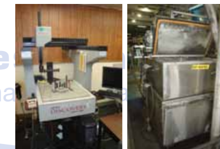
LEFT PIC: CORDAX CMM RIGHT PIC: ELECTRIC EVAPORATOR