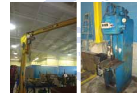
LEFT PIC: FLOOR MOUNTED JIB CRANE WITH HOIST RIGHT PIC: HANNIFIN PRESS