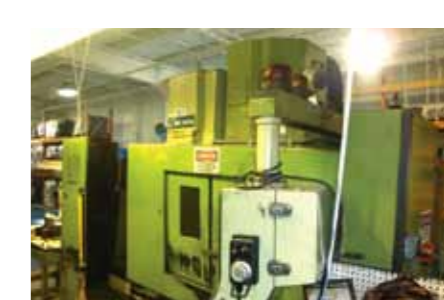
(1 OF 2) OKUMA CNC MC50VA VERTICAL MACHINING CENTERS