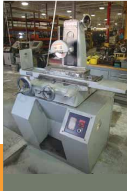
HARIG 618 HANDFEED SURFACE GRINDER