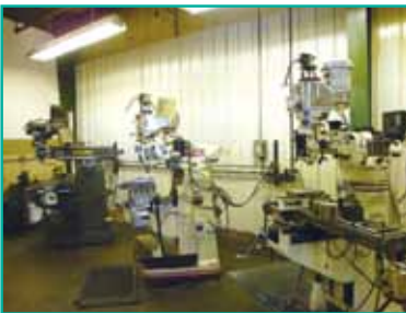
(3 OF 7) VERTICAL MILLING MACHINES

Live Internet Bidding BidSpotter.com ® www.bidspotter.com to register