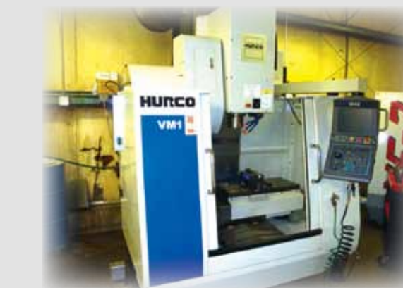
2006 HURCO VM1 CNC VERTICAL MACHINING CENTER