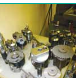
VARIOUS MACHINE TOOLING