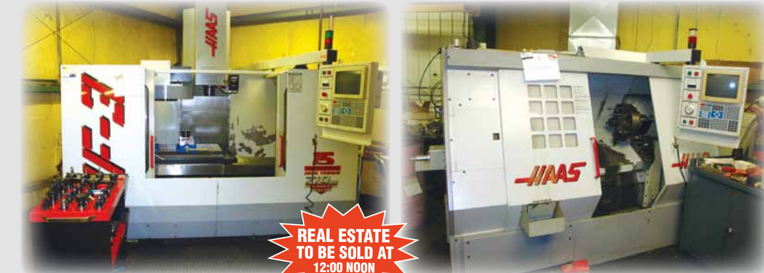
1996 HAAS VF3 CNC VERTICAL MACHINING CENTER

TUESDAY, JUNE 9 th • BEGINNING AT 10:00 A.M. LOCAL TIME