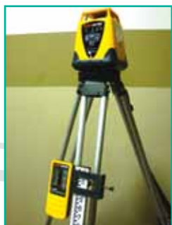
LASER MARK LASER LEVEL

Live Internet Bidding BidSpotter.com ® www.bidspotter.com to register