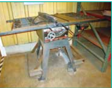
CRAFTSMAN 10" TABLE SAW

Huge Qty. Of Machine Tooling (I.E. Machine Vises, Rotary Tables, Sine Plates, Rotary Cross Slide Tables, 5C Collets, Set-Up Tooling, JACOBS Chucks, Etc.)