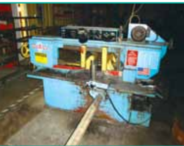
DOALL HORIZONTAL BAND SAW