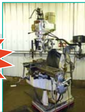
ACER ULTIMA VERTICAL MILLING MACHINE