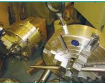
LARGE QTY. OF LATHE TOOLING