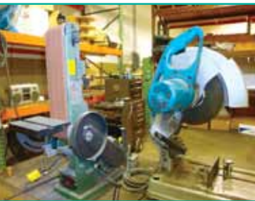
VARIOUS CHOP SAWS & SANDERS