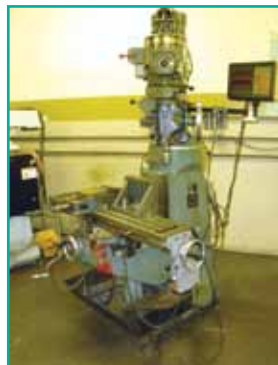
SUPERMAX VERTICAL MILLING MACHINE

Complete Corporate Office (I.E. Desks, Modulars, Office Dividers, Credenzas, Conference Tables & Chairs, File Cabinets, Lateral Files, Copiers, Refrigerator, Microwaves, Etc.)