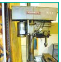
POWERMATIC DRILL PRESS