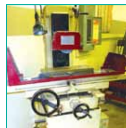
KENT SURFACE GRINDER