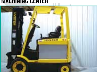
HYSTER 5000 LB. ELECTRIC FORK TRUCK