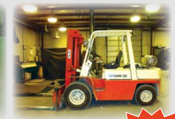
NISSAN 9,000 LB. FORK LIFT