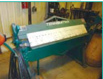
TENNSMITH 48" FINGER BRAKE