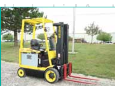
HYSTER 5000 LB. ELECTRIC FORK TRUCK