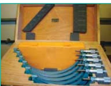
LG. QTY. OF VARIOUS Q.C. EQUIPMENT