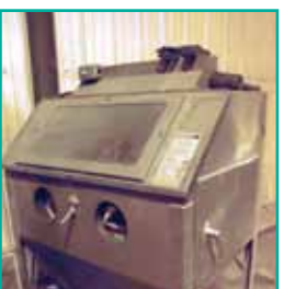
ECON-O-LINE BLAST CABINET