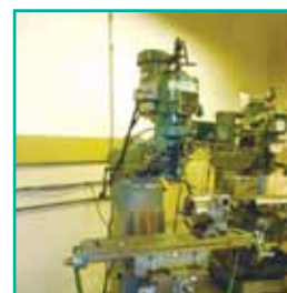
NEWLINE VERTICAL MILLING MACHINE

NEWLINE Vertical Milling Machine, 2 HP, Collet Set, SONY DRO, 9" x 42" T-Slot Table