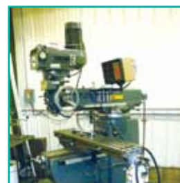
LAGUN VERTICAL MILLING MACHINE