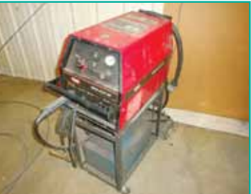
LINCOLN PLASMA CUTTER