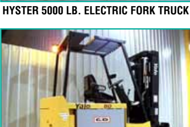
YALE 8000 LB. ELECTRIC FORK TRUCK

CHARLESTON VALUATION GROUP Midwest's Authority on Equipment Values! Contact us Today: 1-260-373-0850 or check for us on the web: www.charlestonauctions.com