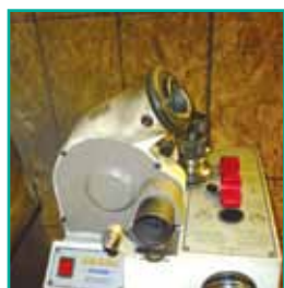
DAREX ULTRA PRECISION TOOL SHARPENER