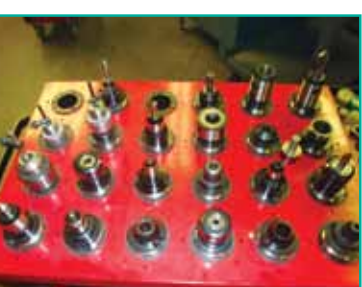
HUGE QTY. OF CNC TOOL HOLDERS