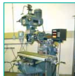
LAGUN FTV-1 VERTICAL MILLING MACHINE