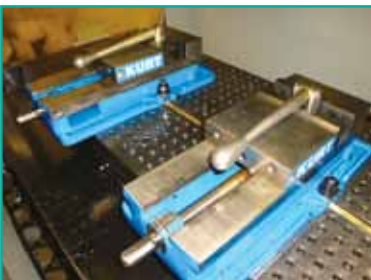
HUGE QTY. OF MACHINE TOOLING