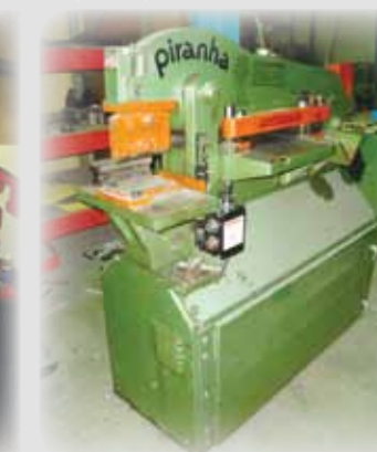
PIRAHNA P50 IRONWORKER