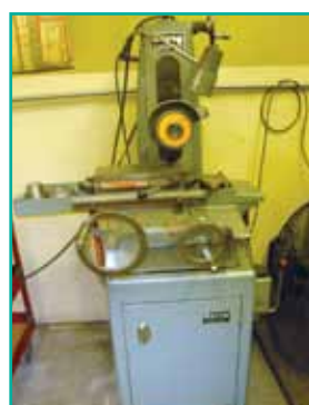
HARIG SURFACE GRINDER