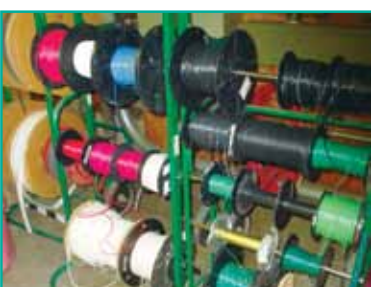
SPOOLED WIRE & RACKS