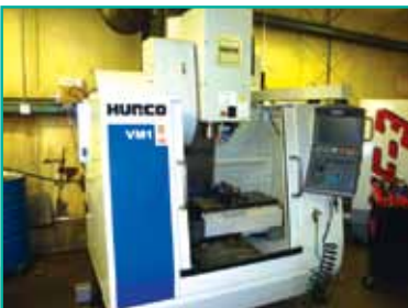
2006 HURCO VM1 CNC VERTICAL MACHINING CENTER