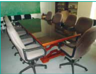
CONFERENCE TABLE & CHAIRS

CHARLESTON VALUATION GROUP Midwest's Authority on Equipment Values! Contact us Today: 1-260-373-0850 or check for us on the web: www.charlestonauctions.com