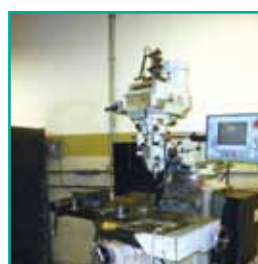
HURCO CNC VERTICAL MILLING MACHINE