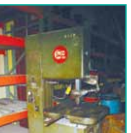
GROB VERTICAL BAND SAW