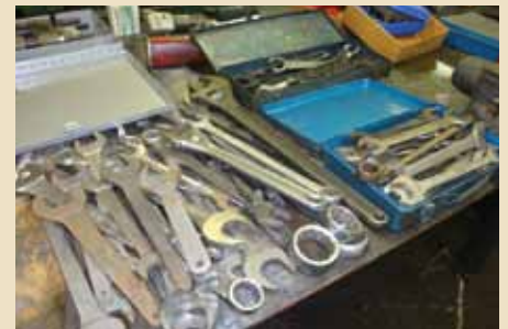
HUGE QTY. OF HAND TOOLS