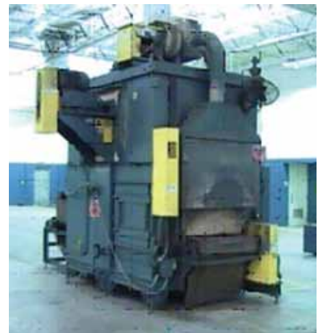
OSI 68738 BELT DRIVEN OVEN