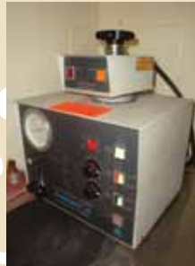
LEFT PIC: BUEHLER II MOUNTING PRESS RIGHT PIC: HANDY HERMAN TELESCOPING MAN LIFT