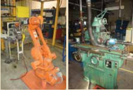
LH PIC: 2001 ABB IRB1400 ROBOT