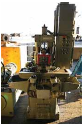
KENT-OWENS 1-14 PRODUCTION MILL 9x32 TABLE