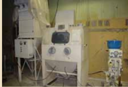
SODA BLASTING SYSTEM