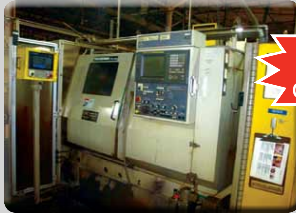
(1 OF 3) TAKISAWA HORIZONTAL TWIN SPINDLE CNC MACHING CENTER