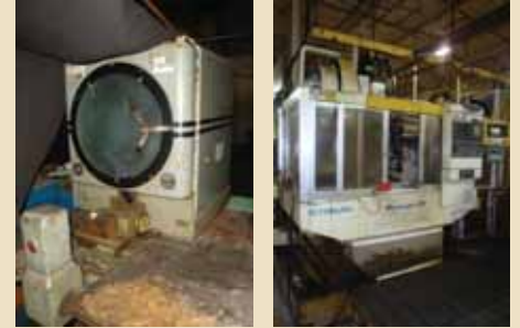
LH PIC: (1 of 5) VARIOUS OPTICAL COMPERITOR RH PIC: (1 of 2) KITAMURA MC 3X VMC