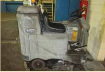
ADVANCE FLOOR SCRUBBER