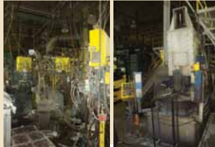
LEFT PIC: (1 OF 2) AUTOMATED ROBOT CASTING CELLS COMPLETE RIGHT PIC: 1989 TREE CITY 4 WAY CUT OFF SAW