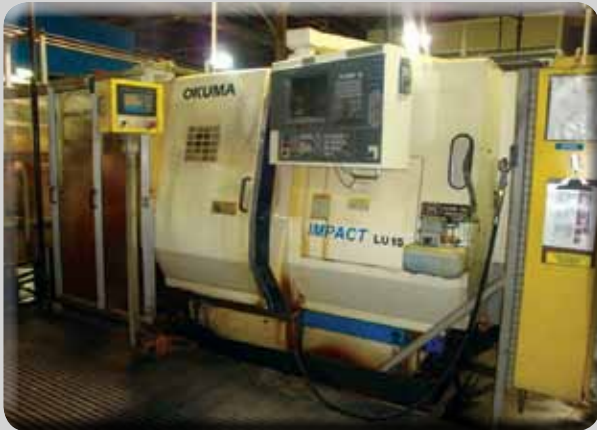
(1 OF 2) OKUMA LU15 HORIZONTAL CNC MACHING CENTERS

Preview Inspection: Tuesday, Jan. 19 th 9:00 a.m. - 5:00 p.m.