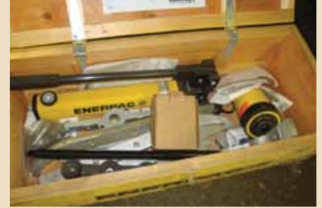
ENERPAC 20 TON GEAR PULLER