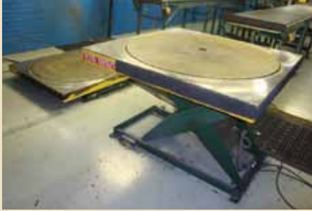
(2) ROTARY SCISSOR LIFT TABLES

PREVIEW: TUESDAY, JAN. 19 TH - 9:00 AM - 5:00 PM