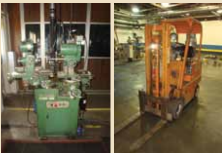
LH PIC: CINCINNATI MILACRON MODEL MT MONOSET CUTTER TOOL GRINDER