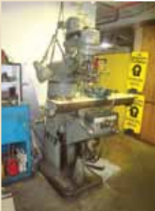
LEFT PIC: BRIDGEPORT VERTICAL MILLING MACHINE RIGHT PIC: BUEHLER 10-1000 CUTTER