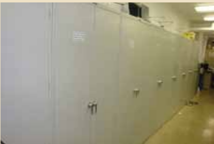
HUGE QTY OF LIKE NEW STORAGE CABINETS