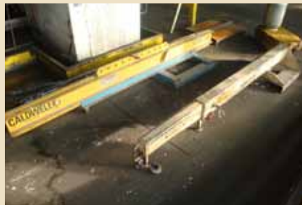
VARIOUS FORK TRUCK BOOM ATTACHMENTS