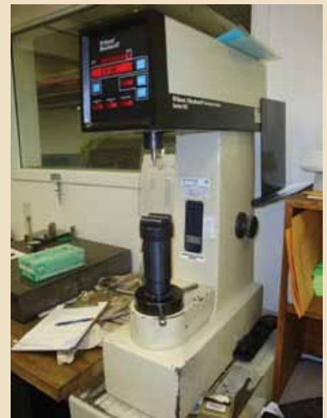
WILSON ROCKWELL HARDNESS TESTER SERIES 500