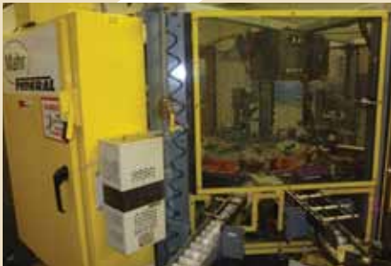
LATE MODEL MAHR FEDERAL INSPECTION CELL