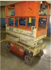
LEFT PIC: JLG 1932E SCISSOR LIFT RIGHT PIC: OPG 14 INCH OPTICAL COMPERITOR