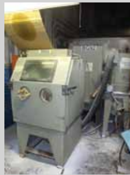
COMPLETE BLAST SYSTEM