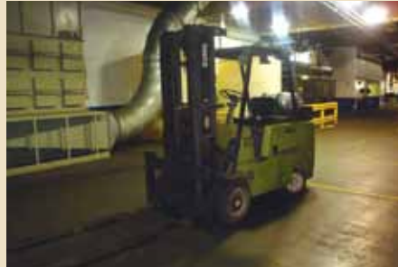
CLARK 8,000 LB. LP FORK TRUCK