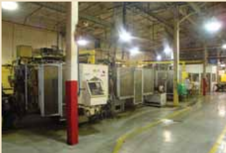
COMPLETE CELLULAR CONCEPTS PRODUCTION CELL