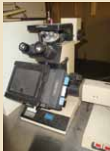
LEFT PIC: UNIMET UNITRON MICROSCOPE RIGHT PIC: VARIOUS RIGGING EQUIPMENT