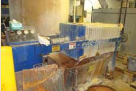
(1 OF 2) COMPLETE WASTE WATER TREATMENT SYSTEMS