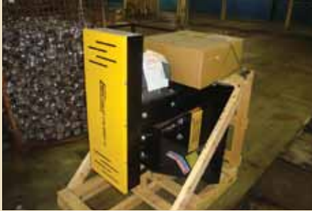
NEW CHICAGO 18 1-4 BLOWER