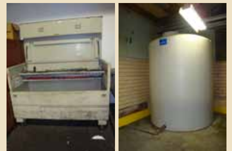
LH PIC: VARIOUS JOB & GANG BOXES