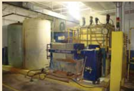
COMPLETE WASTE WATER TREATMENT SYSTEM