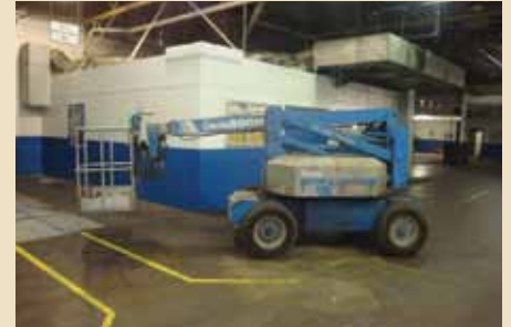
GENIE ELECTRIC BOOM LIFT