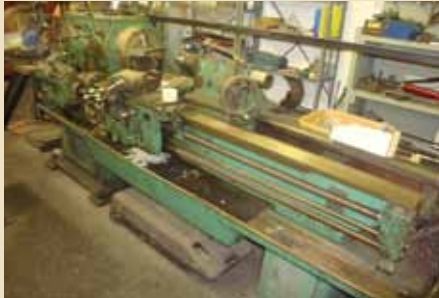
LEBLONDE ENGINE LATHE