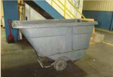
(OVER 50) PLASTIC AND STEEL DUMP HOPPERS