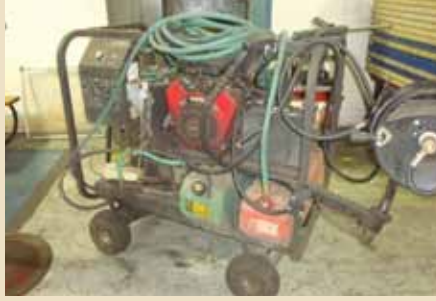
KARCHER HOT WATER PRESSURE WASHER