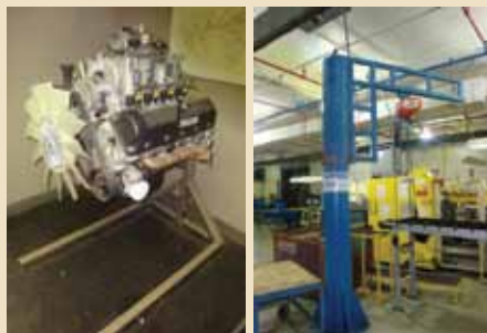
LH PIC: DISPLAY ENGINE