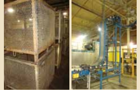
LH PIC: (OVER 50) STEEL WIRE BASKETS & TUBS