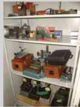
HUGE QTY OF VARIOUS INSPECTION EQUIPMENT