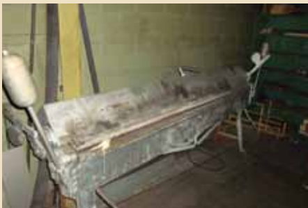
10' PAN BRAKE