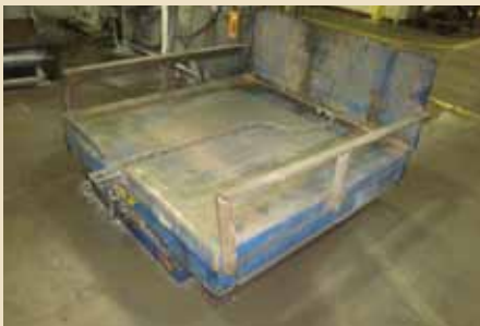
(OVER 10) VARIOUS DUMP TABLES