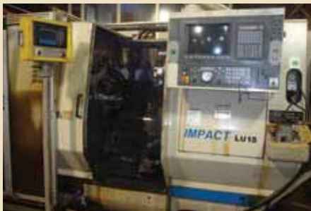
OKUMA LU15 HORIZONTAL TWIN SPINDLE CNC MACHINING CENTER