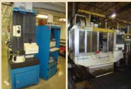
LH PIC: ADCOLE INSPECTION GAGE MODEL 911-24 RH PIC: KITAMURA MC 3X VERTICAL MACHINING CTR.