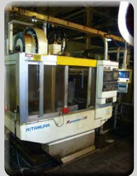
(1 OF 2) KITAMURA MC 3X VERTICAL MACHING CENTERS

Charleston Auctions "International Industrial Auction Services"