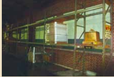
(20) SECTIONS OF VARIOUS PALLET RACKING