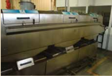
2000 CUDA PARTS WASHER