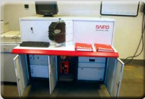
1994 BAIRD 2000 SPECTROVAC