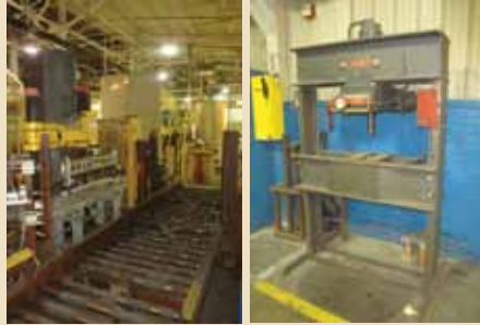
LH PIC: COMPLETE 10 STATION ROBOTIC PALLETIZER