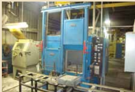
WISCONSIN DBL OVEN