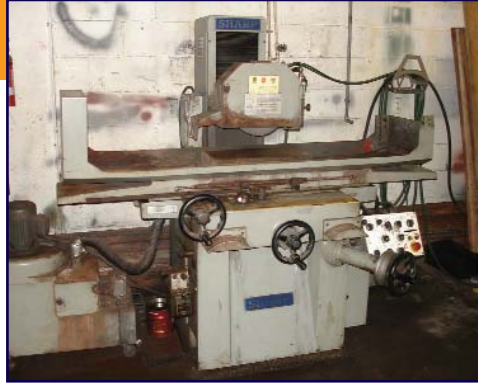
1996 SHARP 1124 HYDRAULIC WET GRINDER