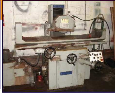
1996 SHARP 1124 HYDRAULIC WET GRINDER