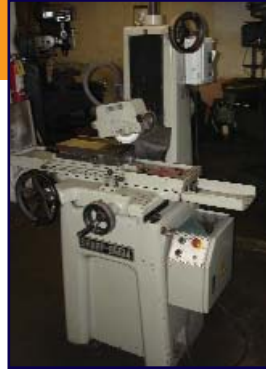
SHARP SURFACE GRINDER