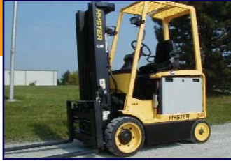
(2) 1999 HYSTER 5,000 LB ELECTRIC FORK LIFTS