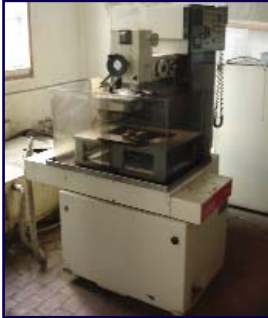
JAPAX WIRE EDM