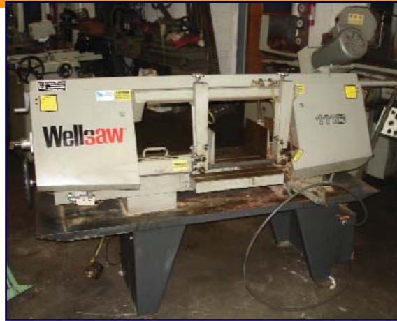
2001 WELLSAW HORIZONTAL BAND SAW