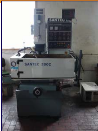
1996 SANTEC 300C RAM TYPE EDM