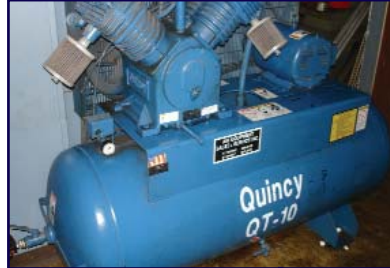
QUINCY QT-10 HORZ. AIR COMPRESSOR