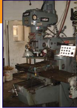
LAGUN FTV-2 VERTICAL MILLING MACHINE