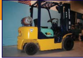
KOMATSU 4,000 LB LP FORK LIFT