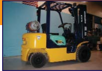
KOMATSU 4,000 LB LP FORK LIFT