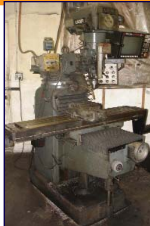
LAGUN 'DELUXE' CNC VERTICAL MILLING MACHINE