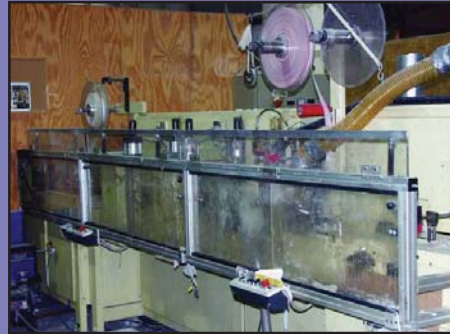
1996 SC-50 Sanitary Napkin Production Line