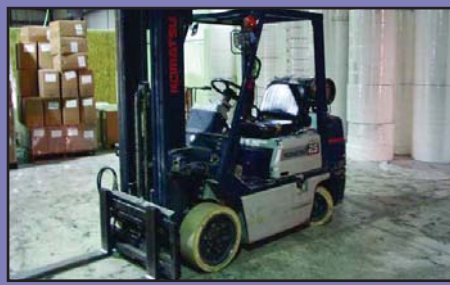
1995 KOMATSU 5,000lb Fork Lift