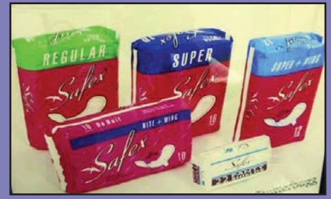
Sample Finished Inventory