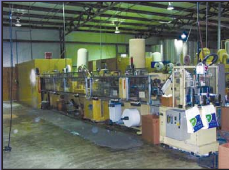
1995 SC-75 Sanitary Napkin Production Line

Sale Location: 1001 Vision Drive, Van Wert, Ohio, 45891