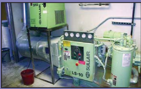
1 of 2 SULLAIR Rotary Screw Air Compressors