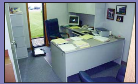
Complete Office Package