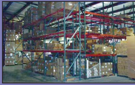
20 + Sections of Heavy Duty Pallet Racking