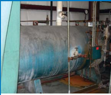
COMPLETE GAS FIRE BOILER