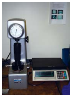
SMALL QTY. OF Q.C. & LAB EQUIPMENT