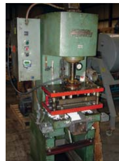
DENNISON MULTI PRESS