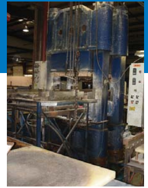
(1) OF (4) HYDRAULIC MOLD PRESSES