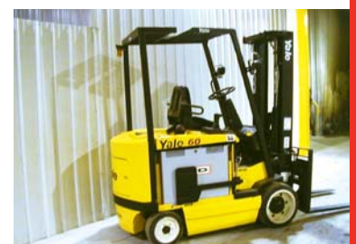
YALE FORK LIFT