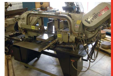
WELLSAW HORIZONTAL METAL CUTTING BAND SAW