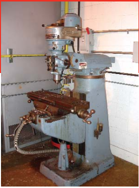
BRIDGEPORT VERTICAL MILL