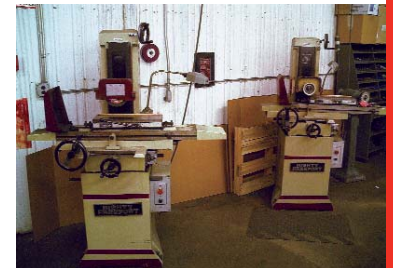
VARIOUS SURFACE GRINDERS