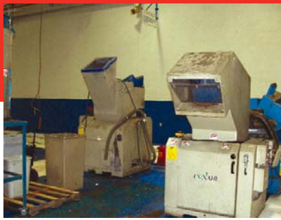
VARIOUS CONAIR GRANULATORS