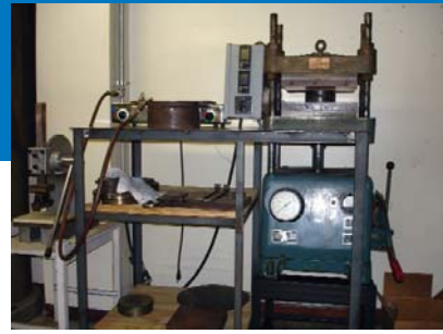
WABASH LAB PRESS