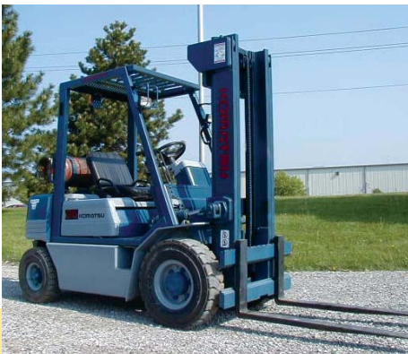
1997 KOMATSU 4,000 LB. FORK TRUCK

7450 S. Homestead Drive, Hamilton, IN WEDNESDAY, JUNE 21st - 10:00 A.M.