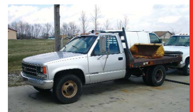
CHEVROLET STAKE BED TRUCK