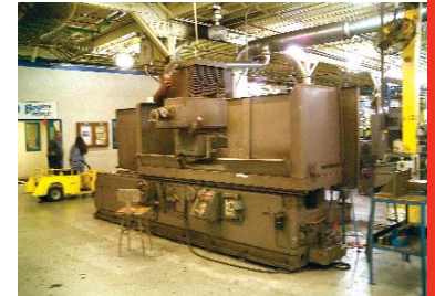
THOMPSON HYDRAULIC SURFACE GRINDER