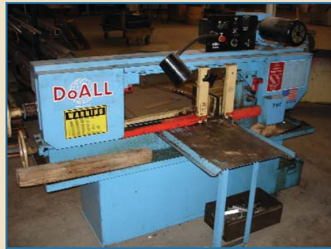
DOALL HORIZONTAL BAND SAW