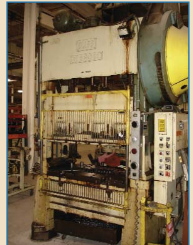
BLISS 50 TON STRAIGHTSIDE PRESS

Charleston Auctions "International Industrial Auction Services"