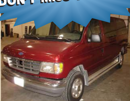
(1 OF 2) FORD ECONOLINE VANS

Surplus To The On-Going Needs Of: Kennedy MANUFACTURING COMPANY 550 Bonnewitz Ave., Van Wert, OH Wednesday, December 14th - 10:00 A.M.