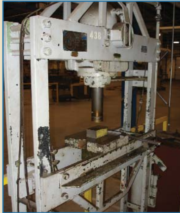
K.R. WILSON 75 TON H-FRAME PRESS