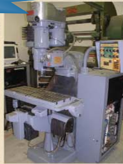
BRIDGEPORT CNC VERTICAL MILL