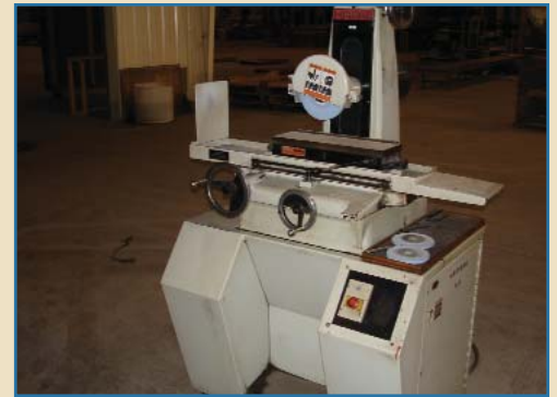
HARIG 618 SURFACE GRINDER