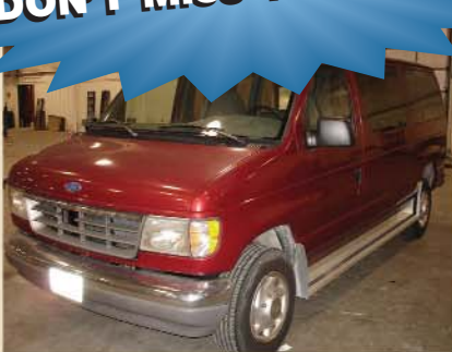
(1 OF 2) FORD ECONOLINE VANS

Surplus To The On-Going Needs Of: Kennedy MANUFACTURING COMPANY 550 Bonnewitz Ave., Van Wert, OH Wednesday, December 14th - 10:00 A.M.