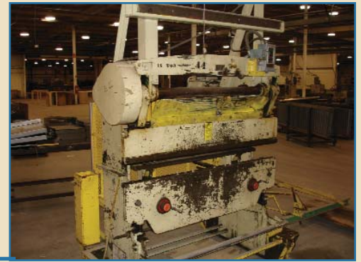
CHICAGO 44 TON PRESS BRAKE