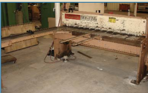
NIAGARA POWER SHEAR