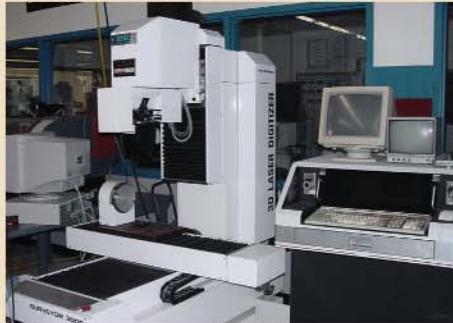
LASER DESIGN 3 D LASER DIGITIZER