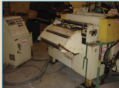
COE STEEL STRAIGHTENER