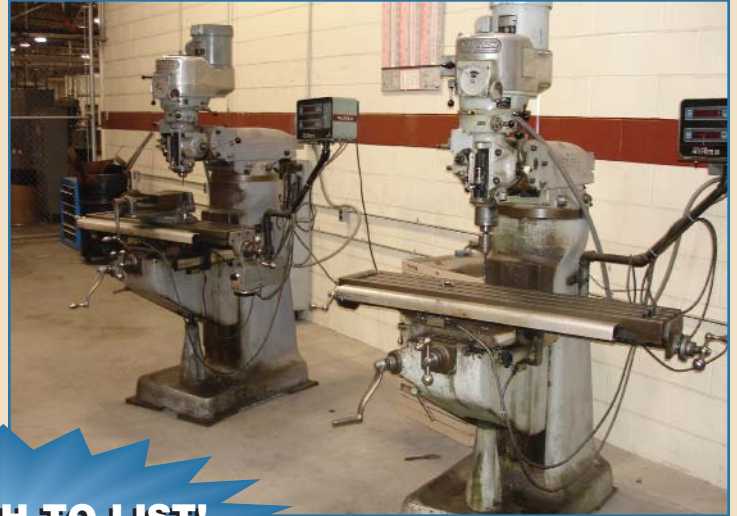
(2) BRIDGEPORT VERTICAL MILLS

PREVIEW INSPECTION: Tuesday, December 13th 9:00 A.M. - 5:00 P.M.