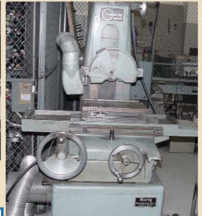
HARIG 6X12 SURFACE GRINDER