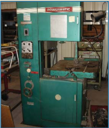
POWERMATIC VERTICAL BAND SAW