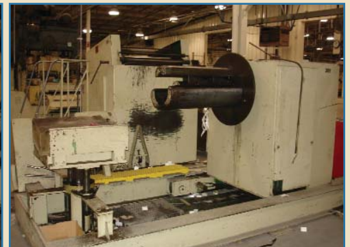
AMERICAN STEEL DEREELER