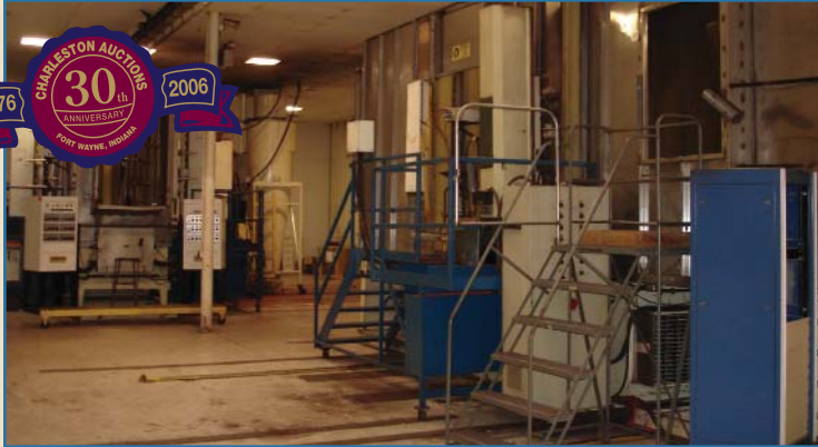
1998 COMPLETE POWDER COAT PAINT LINE