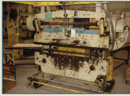
CHICAGO 18 TON PRESS BRAKE