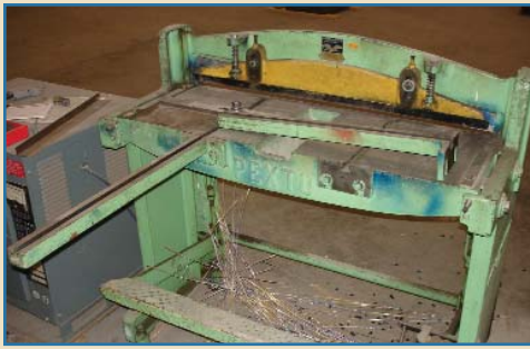
PEXTO STOMP SHEAR