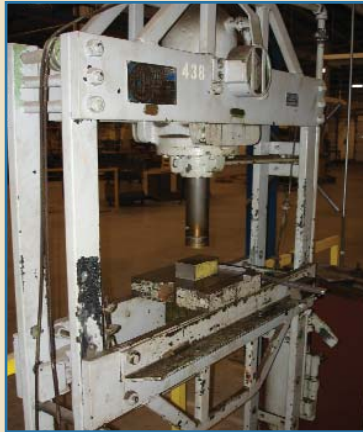
K.R. WILSON 75 TON H-FRAME PRESS