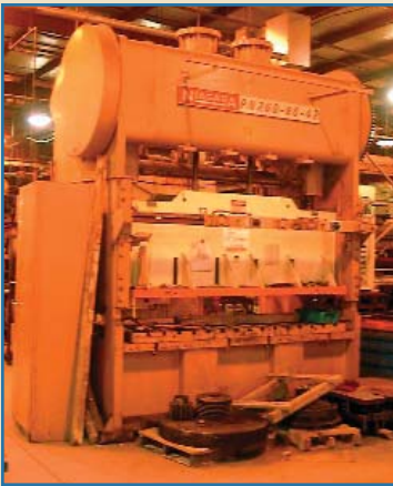
NIAGARA 260 TON PRESS