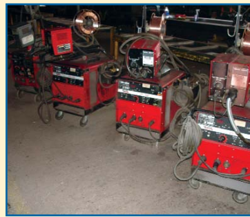
VARIOUS LINCOLN WELDERS