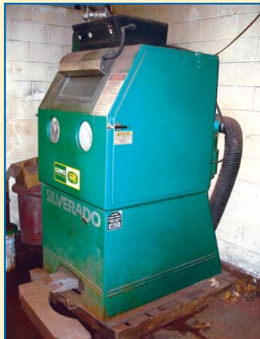
CLEMCO SILVERADO BLAST CABINET