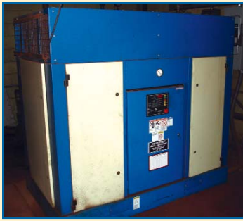
QUINCY 50 HP ROTARY AIR COMPRESSOR