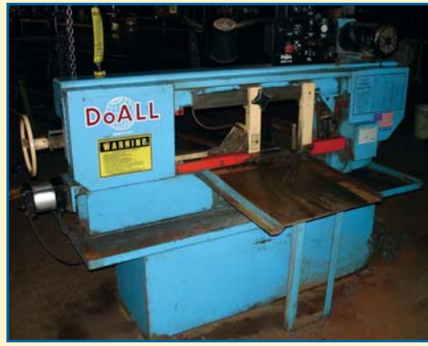
DOALL HORIZONTAL BAND SAW