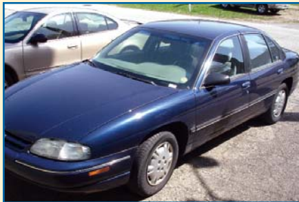
1998 CHEVY LUMINA