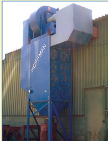
HOFFMAN DUST COLLECTOR