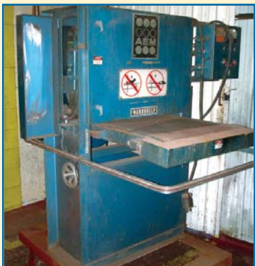
AEM 24" BELT SANDER