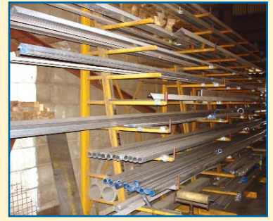
LG. QTY. OF FABRICATED ALUMINUM & STEEL