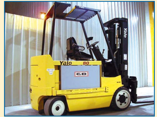
2000 YALE 8,000 LB. ELECTRIC FORK LIFT