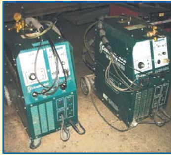
(2) COBRAMATIC WELDERS