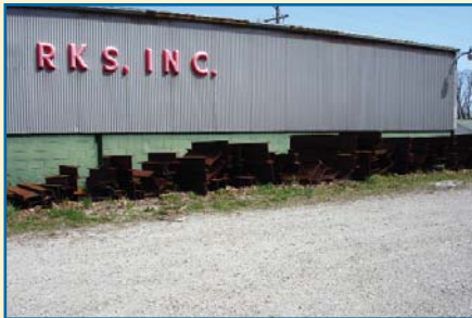
REAL ESTATE AVAILABLE