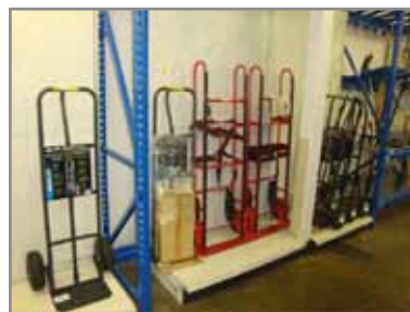
CARTS AND DOLLIES