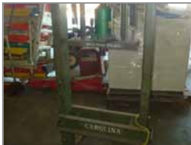
CAROLINA 50 TON H-FRAME PRESS