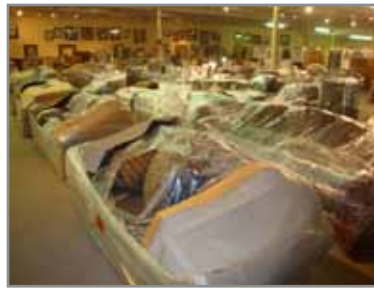
SOFAS AND CHAIRS