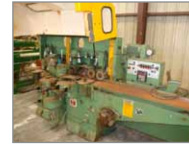
LG QTY OF WOODWORKING EQUIPMENT