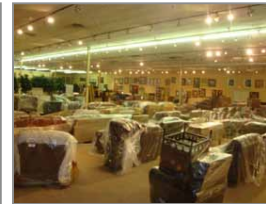
COMPLETE FURNITURE SHOW ROOM