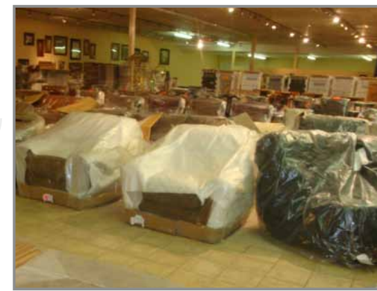
NEW FURNITURE WRAPPED AND READY FOR SHIPPING