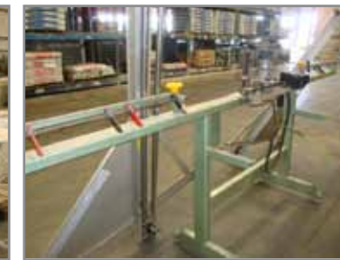
DOOR STRIKE MACHINE