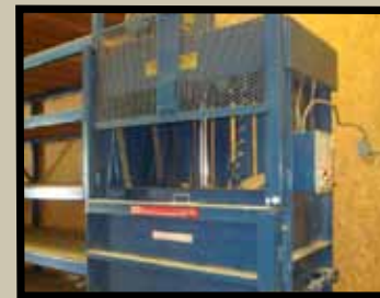
1 OF 3 CRAM-A-LOT CARDBOARD BAILERS

Day 1 ABSOLUTE Day 2 Friday, August 6th EVERYTHING MUST SELL REGARDLESS OF PRICE! Saturday, August 7th AUCTION!