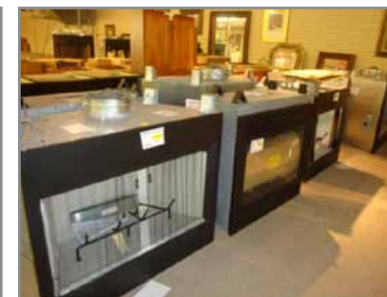
OVER 30 FIREPLACE INSERTS