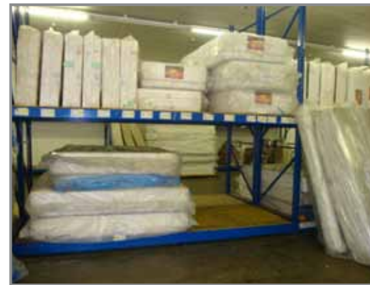
BEDS AND MATTRESSES