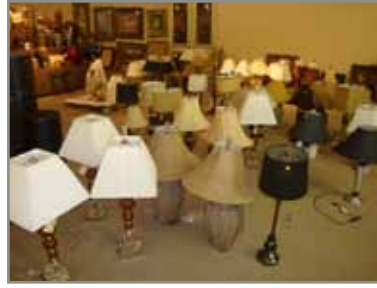
LAMPS AND LIGHTING