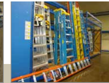
ALUMINUM AND FIBERGLASS LADDERS

PREVIEW INSPECTION: Thursday, August 5th from 9AM - 5PM (CDT)