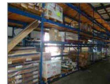
TILE AND LAMINATE FLOOR COVERINGS