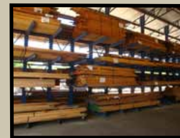
CEDAR, WALNUT, MAHOGANY, SPANISH CEDAR, POPLAR