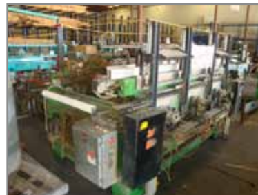
COMPLETE RUVO DOOR MACHINE