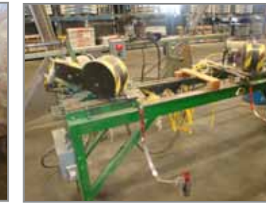
RUVO DOOR MITRE SAW