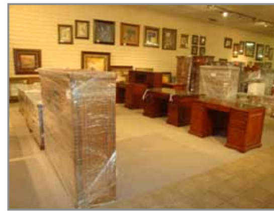
DESKS AND OFFICE FURNITURE