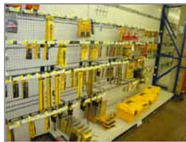
DEWALT BITS AND BLADES