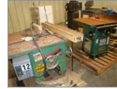
VARIOUS TABLE SAWS