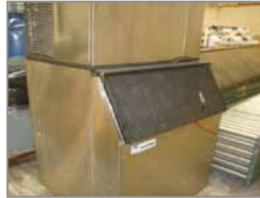
1 OF 3 MANTITOWIC ICE MACHINES