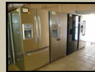
NEW SAMSUNG, WHIRPOOL, FRIGIDAIRE, ELECTROLUX, & KITCHEN AID APPLIANCES