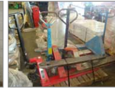
OVER 20 PALLET JACKS