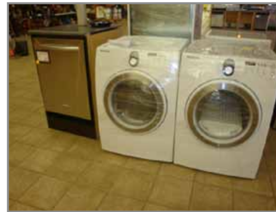
WASHER AND DRYER COMBOS