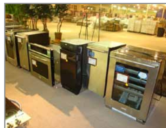
WINE COOLERS, ICEMAKERS, STOVES AND COMPACTORS