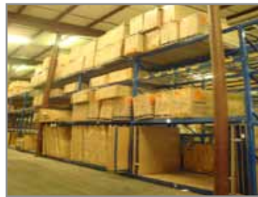
NEW FURNITURE INVENTORY

ABSOLUTE EVERYTHING MUST SELL REGARDLESS OF PRICE! AUCTION!