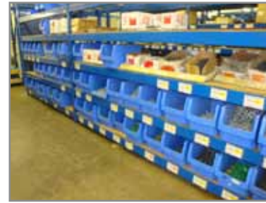
NUTS AND BOLTS HARDWARE