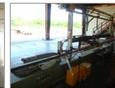
1 OF 3 RUVO DOOR MACHINES