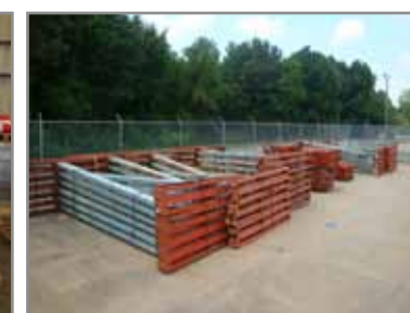
HUGE QTY OF CANTILEVER RACKING