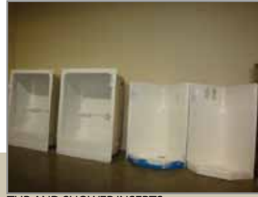
TUB AND SHOWER INSERTS