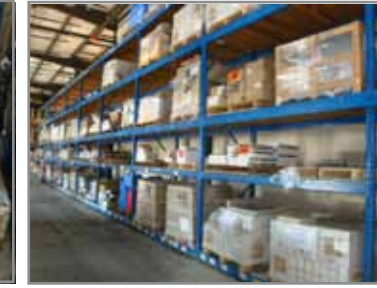
CERAMIC, PORCLINE AND SLATE TILE