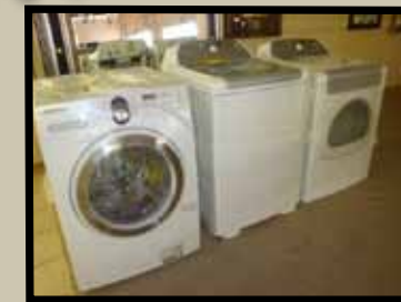
FRONT LOAD WASHER & DRYERS