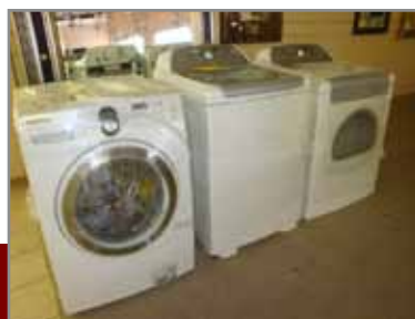
NAME BRAND APPLIANCES