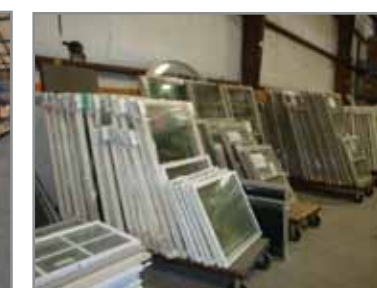
HUNDREDS OF WINDOWS