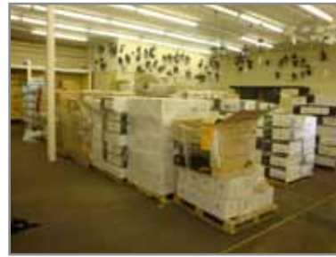
HUNDREDS OF CEILING FANS & LIGHTS