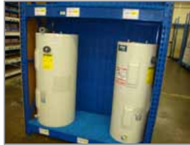
VARIOUS WATER HEATERS