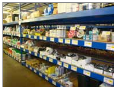
COMPLETE HARDWARE STORE INVENTORY