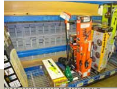
YARD MAINTENANCE EQUIPMENT