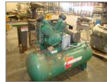
CHAMPION HORIZONTAL AIR COMPRESSOR