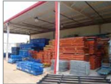
OVER 1500 SECTIONS OF PALLET RACKING