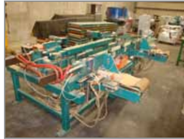
1 OF 2 KAVL DOOR MACHINES