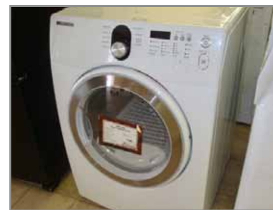
FRONT LOAD WASHER AND DRYERS