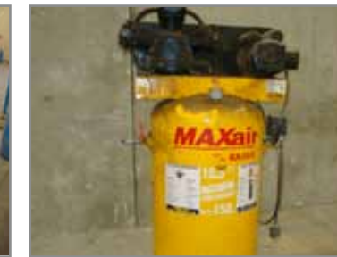
EAGLE VERTICAL AIR COMPRESSOR