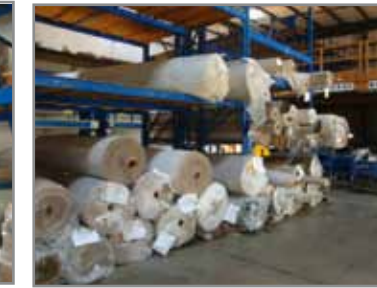
LG QTY OF NEW CARPET