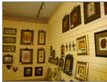
HUNDREDS OF PIECES OF ARTWORK