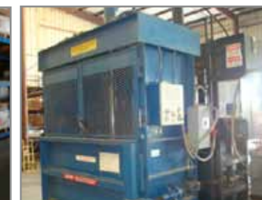
(2) CRAM-A-LOT CARDBOARD BAILERS