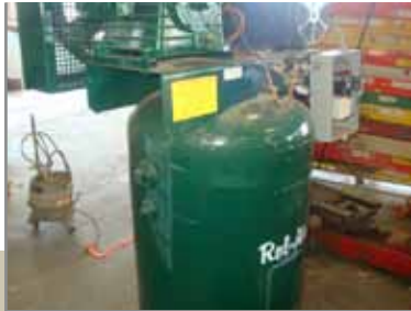
ROL-AIR VERTICAL AIR COMPRESSOR