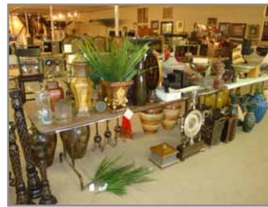
HOME DECOR AND FURNISHINGS INVENTORY