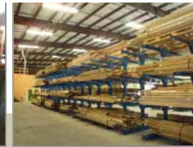
TRIM AND MOULDING