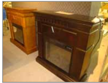
ELECTRIC FIREPLACES WITH MANTELS