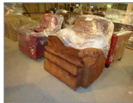
RECLINERS, SOFAS & CHAIRS