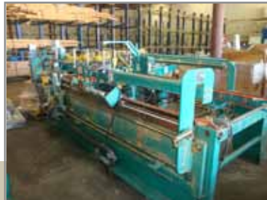
KAVL DOOR MACHINE