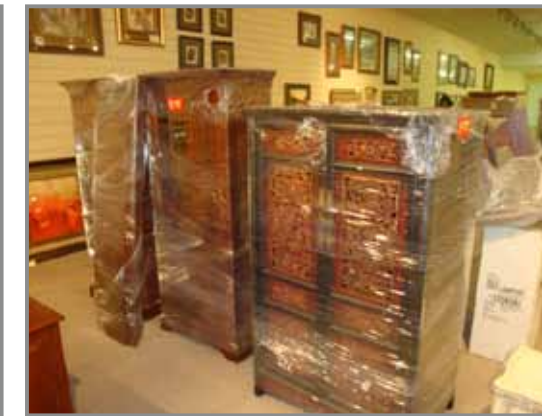
ARMOURS AND BEDROOM FURNITURE