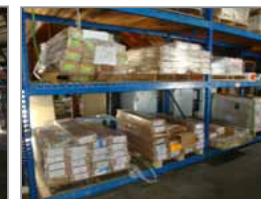
WOOD AND LAMINATE FLOORING