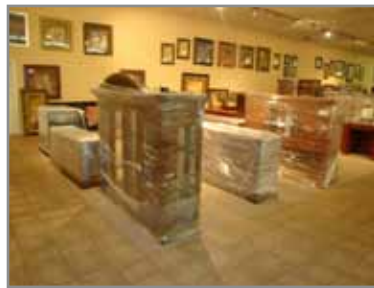
HUTCHES AND CABINETS