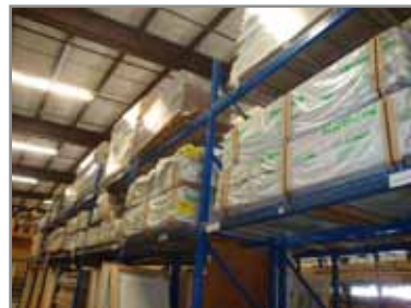
BUNKED TRIM AND MOULDING