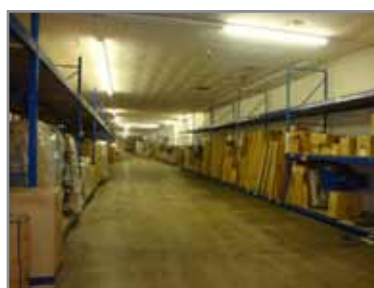
HUGE QTY OF IN THE BOX FURNITURE