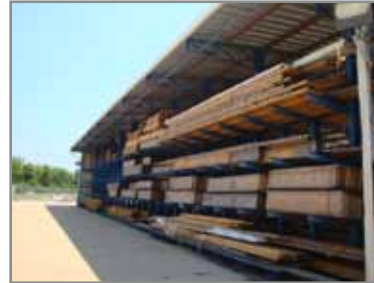
I JOIST AND TRUSS JOIST