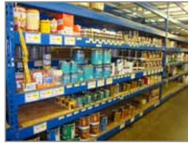
PAINTS AND STAINS