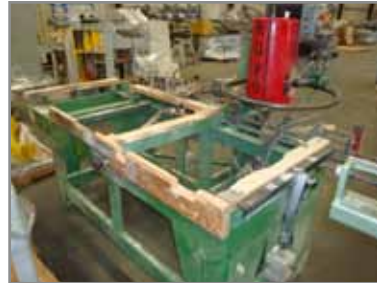
RUVO STEEL DOOR ROUTER