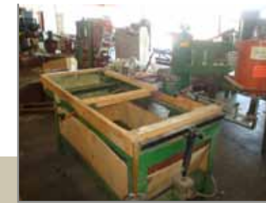
RUVO DOOR MACHINE