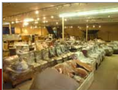
HUNDREDS OF CHAIRS