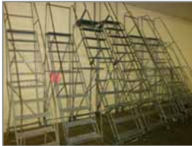
OVER 25 SAFETY LADDERS