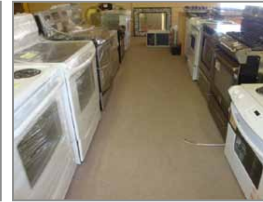
STOVES, OVENS AND RANGES