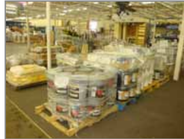
PALLETS OF PAINTS & STAINS