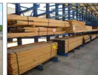
HUGE QTY OF VARIOUS LUMBER