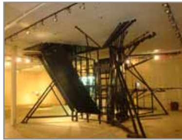
1 OF 3 AREA RUG DISPLAY SYSTEMS