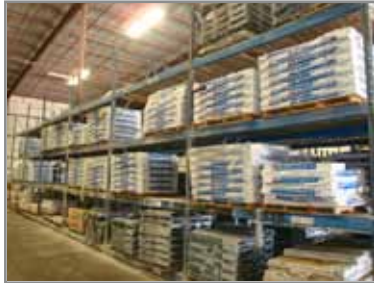
SHINGLES AND ROOFING MATERIAL