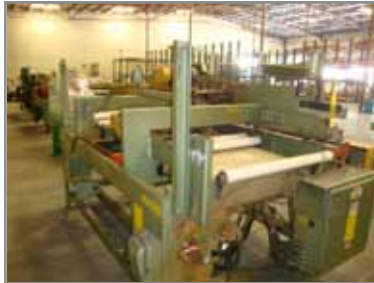
RUVO TRIAD DOOR MACHINE