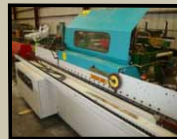
GENESIS 1435E TENNONER