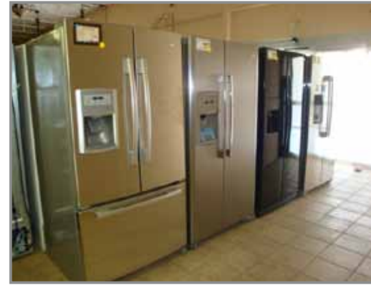
HIGH END APPLIANCES