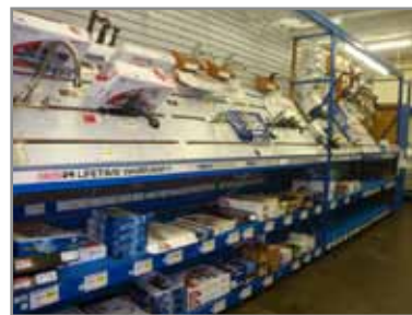
DELTA AND PEERLESS FAUCETS