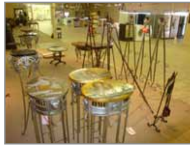
STANDS AND DISPLAYS