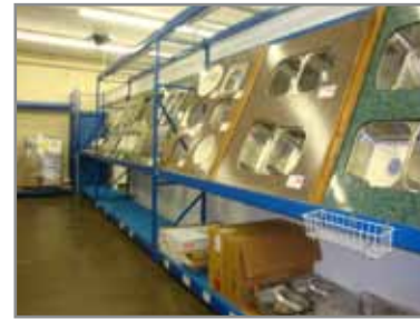
KITCHEN AND BATH DISPLAYS