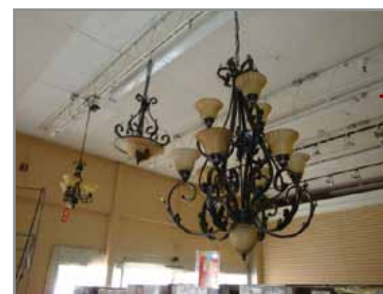
HUNDREDS OF HANGING LIGHT FIXTURES