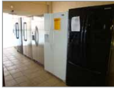
NAME BRAND REFRIGERATORS