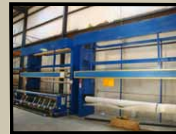
FAB-TECH ROTARY CARPET HANDLING SYSTEM