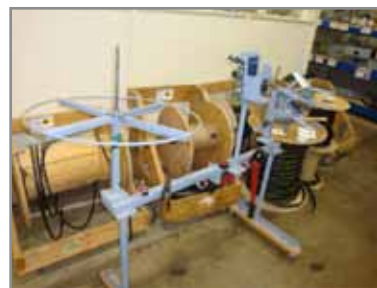
CABLE AND CUTTER