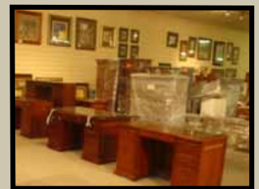
HOME & OFFICE FURNITURE