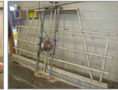
MILWAUKEE PANEL SAW