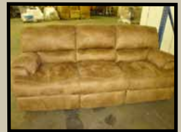
COMPLETE FURNITURE SHOWROOM